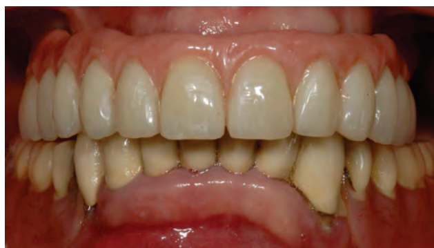
Fig. 4 Intraoral frontal view of the definitive restoration delivery.