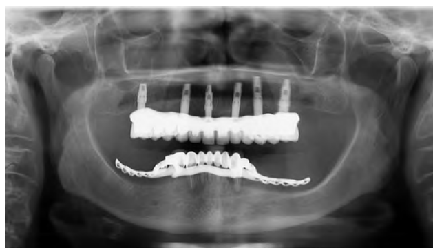
Fig. 5 Radiographic control at the definitive restoration delivery.

technique with Rinn's film holder (Rinn XCP, Dentsply, Elgin, Illinois, United States) taken at implant placement and loading (baseline) and then 1 year after. All the radiographs have been analyzed through a dedicate software (DFW2.8 for Windows, Soredex, Tuuka, Finland) and calibrated for each image using the known distance between two consecutive threads. Difference between baseline and last follow-up was taken as MBL. A dentist, not previously involved in this study, performed every radiographic measurement.