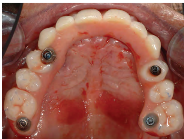
Fig. 2 Intraoral occlusal view at immediate loading (enlargement).

patients received drugs prescription and oral and written recommendations about the correct oral hygiene maintenance and diet. Total 3 to 5 months after implant placement, definitive, abutment-level impressions were taken and screw-retained, CAD/CAM, titanium-composite restorations were delivered (► Figs. 3 and 4 ). Before screwing, the acetal rings (Seeger system, Rhein'83) were placed between the subequatorial area of the OT Equators (Rhein'83) and the cylindrical "extragrade" framework connections. The prosthesis was screwed twice at 20 Ncm. Occlusion was adjusted and patients were enrolled in a strictly follow-up protocol including occlusal adjustment and hygiene maintenance every 6 months and radiographs every year (► Fig. 5 ).