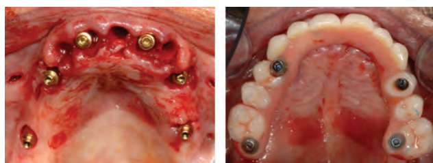
Fig. 1 Intraoral view immediately after implant placement and loading.