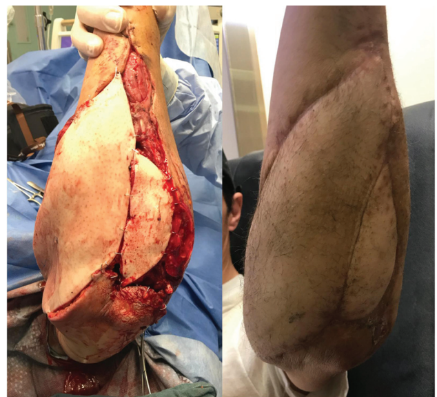
Fig. 3 (A) Intraoperative photo following fasciocutaneous ALT and osteocutaneous fibular flap reconstruction (B) Clinical photograph at 6-month postoperatively. ALT, anterolateral thigh.

Advances in surgical technique have led to increased limb salvage rates following severe extremity trauma. The reconstruction of these complex and often contaminated wounds usually requires temporizing external fixation and staged washouts to obtain a clean recipient site for soft tissue reconstruction. Microvascular free flaps have revolutionized