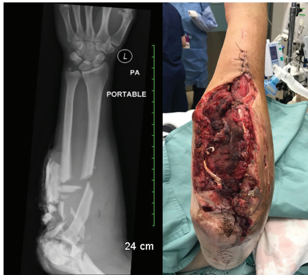
Fig. 1 (A) Left arm X-ray upon presentation to the emergency room. (B) Soft tissue defect following second irrigation and debridement.

The patient underwent irrigation and debridement of his contaminated and highly comminuted left elbow fracture the day of admission and an external fixator was applied. The crush injury was noted to have a wide zone of injury with devitalized tissue requiring staged muscle and skin debridement. The comminuted proximal ulnar fragments were found to be devitalized and eventually replaced with a cement spacer as a first stage Masquelet's technique. This was followed by reduction and internal fixation of radius and humerus fractures. The large resulting soft-tissue defect was temporized with a vacuum-assisted device. The plastic surgery service was eventually consulted for soft tissue closure, as well as vascularized bone reconstruction of the 10-cm ulna defect.