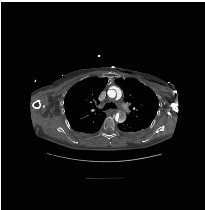
Fig. 2 Angio-computed tomography scan on axial view showing an acute Type A aortic dissection with compression of the true lumen.