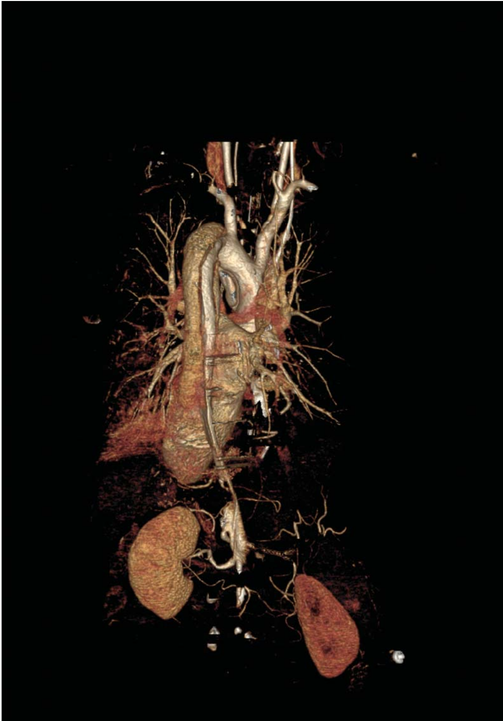
Fig. 3 Three-dimensional volume rendering showing acute Type A aortic dissection.