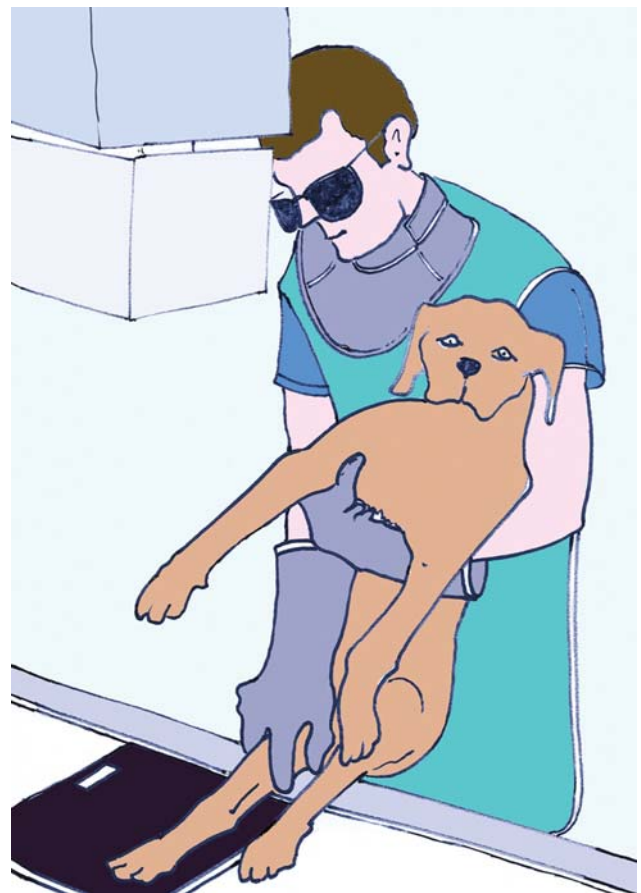
Fig. 1 Cartoon drawing demonstrating manual restraint and positioning to perform the dorsoplantar radiographic view of the tarsus in these dogs. (Artist: Flaminio Addis; copyright Francesca Briotti, 2003) Source: Modified and reprinted with permission from Petazzoni M. Metatarsal rotation in the dog – Early diagnosis. Proceedings of the 2009 American College of Veterinary Surgeons Veterinary Symposium; October 8–10, 2009; Washington DC; pp 327–329.

Bilateral dorsoplantar radiographic projections of the hock were obtained. All puppies were physically restrained (without sedation) in a sitting position (► Fig. 1). A malformation of the central tarsal bone was defined as a large curved bone that appeared to be an extension of this bone on its medial side, or the presence of separate ectopic bone located medially to the central tarsal bone, talus and second metatarsal bones (► Fig. 2). Appearance of ectopic bone formation was defined as an extra ossification site. For each tarsus, malformation of the central tarsal bone and the number and location of ossification sites medial to the central tarsal bone, talus and 2nd metatarsal bones were recorded; furthermore, any supernumerary digits or abnormalities of the metatarsal bones were noted. For the purposes of this study, these findings were consistent with our definition of affected versus non-affected dogs (► Fig. 2).