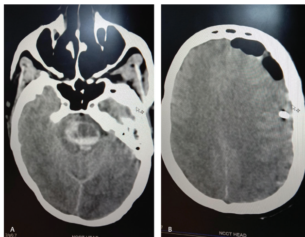
Fig. 2 Postop CT showing brainstem hemorrhage (A) and pneumocephalus with subdural drain tip in situ (B).