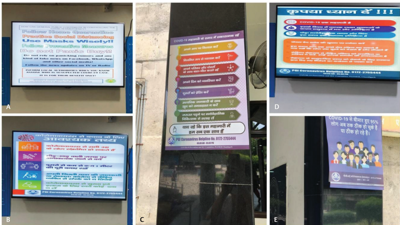
Fig. 2 (A–E) Awareness posters fixed at the entrance of the Advanced Eye Centre, Post Graduate Institute of Medical Education and Research, Chandigarh, India, in the English and Hindi languages along with rotational displays on the television screen.

In the operation theater, donning and doffing should be done using sterile precautions. All staff should be trained to don, doff and in the disposal of PPE including masks (level 2 or 3 FFP, depending on the aerosol-generating risk level), eye goggles, long-sleeved waterproof gloves, gowns, caps, and shoe covers in dealing with suspected/confirmed COVID-19 cases. 24 For all other cases, it should be as per norms. A supervisor should be earmarked to help the eye care professionals and nursing staff carry out these procedures efficiently. Separate shortest routes must exist for suspected/infected COVID-19 individuals. The COVID-19 operating area