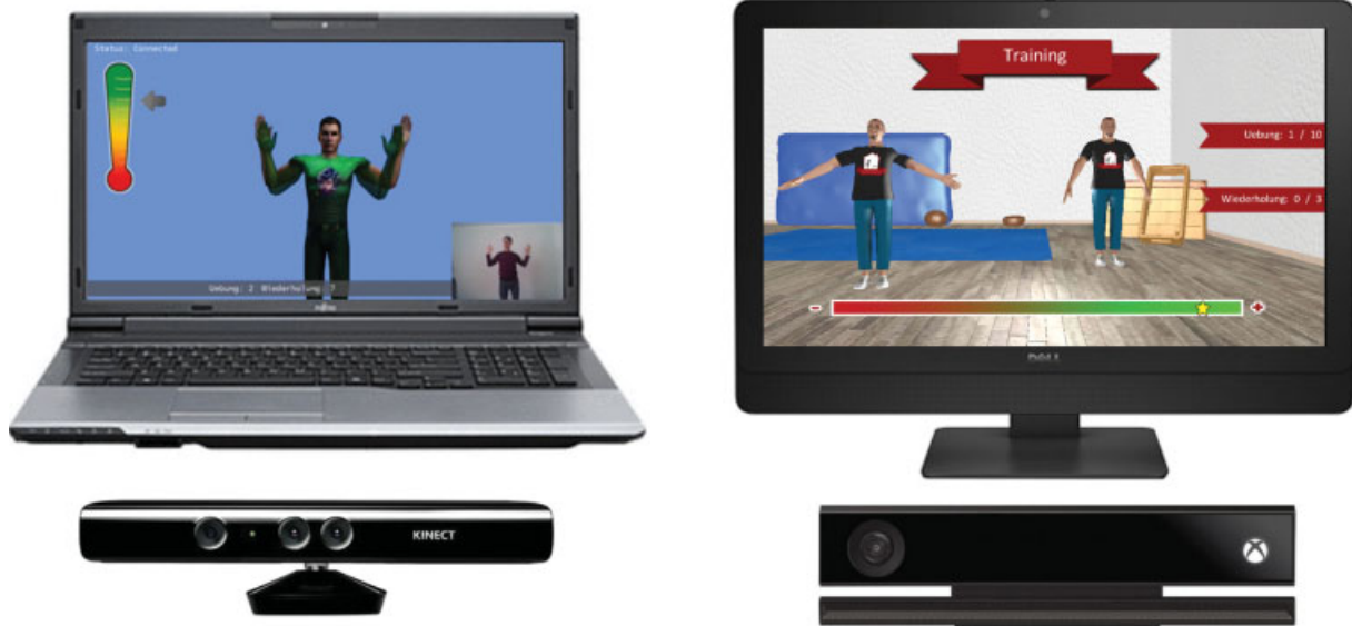
Fig. 1 Training scene in AGT-Reha-V1 (left) and AGT-Reha-V2 (right) in comparison.

based on automatically and securely transmitted exercise data. This comprises only quantity and quality of trainings. Video is neither recorded nor transmitted.