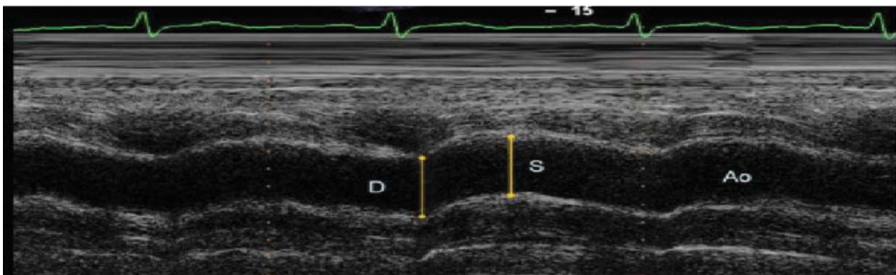
Fig. 1 Measurements of systolic (S) and diastolic (D) diameters of the ascending aorta are shown on the M-mode tracing obtained at a level 3 cm above the aortic valve.

► Table 2 showed the quantities variables comparative in TM and controls based on nonparametric Mann–Whitney U -test. The tables showed that the participant in TM and controls were similar in age ( p = 0.05 ). Weight ( p < 0.001 ) and height ( p = 0.001 ) of the patients were lower than controls. Systolic ( p = 0.009 ) and diastolic ( p < 0.001 ) blood pressures were higher in controls compared with patients, while conventional echocardiography parameters, such as IVSD, PWD, IVSS, and