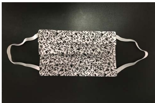
Fig. 2 Handmade Mask (100% cotton - Washable).

transmission of COVID-19. Although there is experimental evidence that facemasks are capable of retaining infectious droplets and potentially reduce transmission, as well as reports of transmission reduction by using facemasks, there is no evidence that such reduction occurs in community environments. Epidemiological studies are needed to eluci-