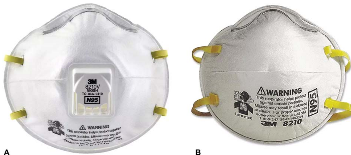
Fig. 1 N95 Respirators 3M (With and Without Valve - Disposable).