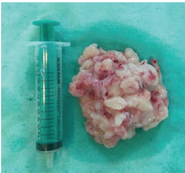
Fig. 3 Gross specimen of the nasal mass.

Since the tumor was benign in nature, decision of endoscopic surgical excision was made and the patient was planned for the surgery after due anesthesiologist and cardiac fitness. The tumor had a pedicle on the right nasal septum near the olfactory cleft, which we extirpated totally, leaving an adequate free margin. As the posterior part of the nasal septum was eroded, we performed posterior septectomy. The thick mucus in the ethmoidal sinus proved to be nonmalignant. Complete removal of the tumor in toto was possible with endoscopic surgery.