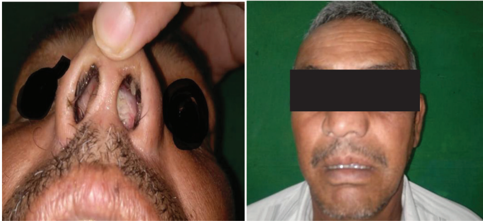
Fig. 1 Nasal mass and external deformity caused by the nasal mass.