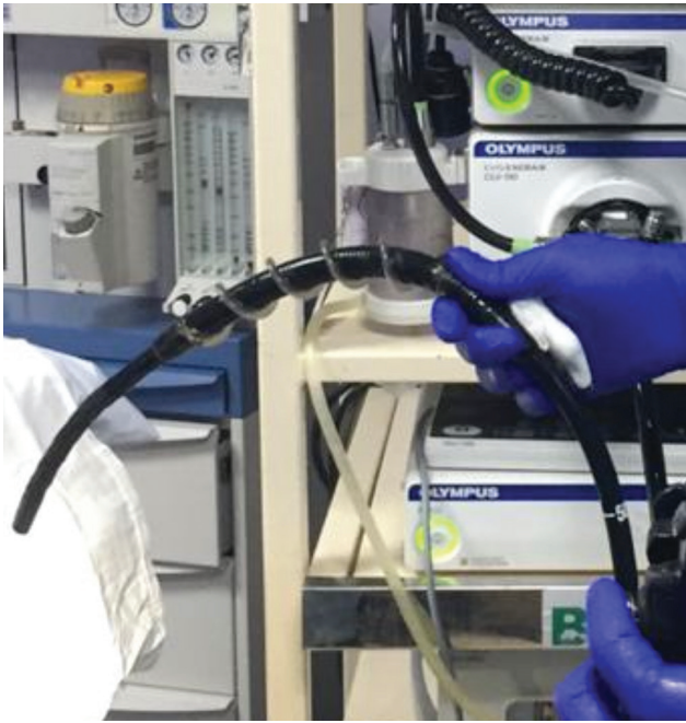
Fig. 1 Novel Motorized Spiral Enteroscope (NMSE; Olympus corp.) with spiral overtube at distal end.