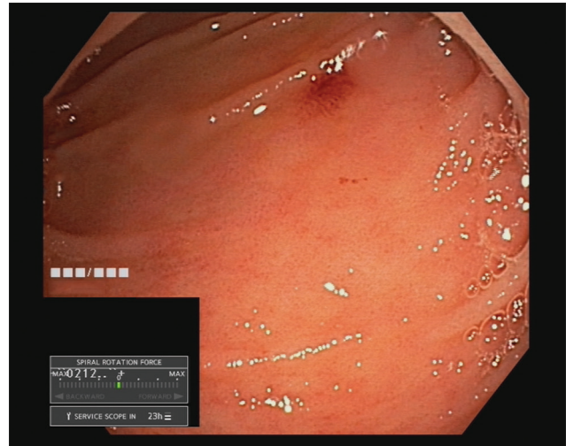
Fig. 3 Angiodysplasia lesion in ileum.

done and both were unremarkable. Ultrasound abdomen and computerized tomography (CT) enteroclysis were also normal. Later small bowel evaluation was performed by using NMSE (►Fig. 1) under monitored anesthesia care. Patient was kept on left lateral posture, scope introduced through oral cavity, and complete small bowel study was done, scope progressed up to cecum within 24 minutes (►Fig. 2). Duodenum and jejunum were normal. Multiple angiodysplasia lesions (►Fig. 3) were noted in proximal ileum and applied argon plasma coagulation (APC) to all lesions during the same session (►Fig. 4). Postprocedure patient recovered well. She was started on thalidomide and discharged. During 3 month postprocedure follow-up period, she never had recurrence of symptoms and her hemoglobin level remained stable.