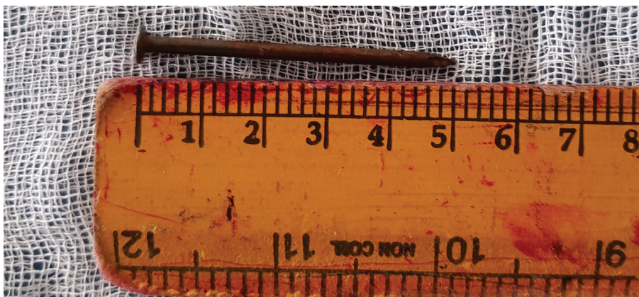
Fig. 3 Retrieved nail of 5 cm in size.