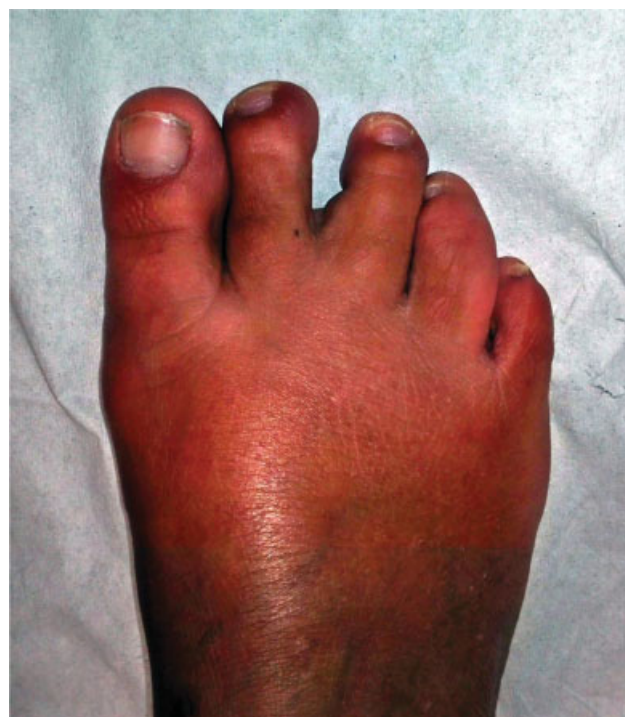
Fig. 4 The bearing foot showed an enlargement in the second interdigital space.

incision allowed us to have enough exposure for accurate dissection of the neuroma and its removal.