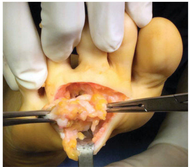
Fig. 1 Dissection of the lesion through a plantar transverse approach.

The lesion was excised trying to follow the common digital nerve proximally and to isolate the two digital nerves