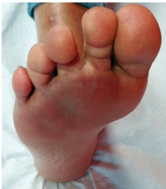
Fig. 3 The surgical wound 6 months after operation was perfectly healed, and no calluses were evident.