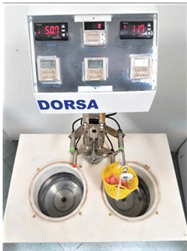
Fig. 4 Thermocycling machine (3000 thermal cycles in 5 and 55°C temperatures with a dwell time of 30 seconds).

concentration and thermocycling) and independent t -test using SPSS version 22. One-way ANOVA (followed by Tukey's multiple comparison test) was carried out to assess the effect of the addition of different concentrations of SNPs on tensile bond strength in thermocycled and nonthermocycled groups. Independent t -test was performed to compare the effect of thermocycling in each SNP concentration. p < 0.05 was considered statistically significant.