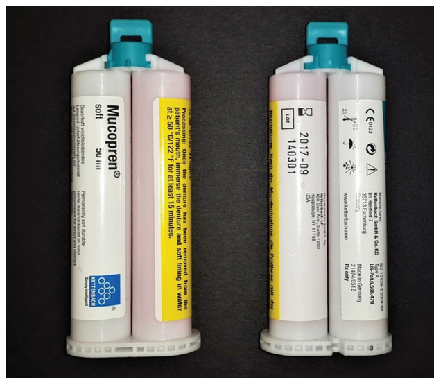
Fig. 2 Mucopren auto cure silicone long-term liner supplied as two pastes.