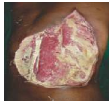
Figure 2 : A Fluoroscopic image of needle placement in AP view. B Fluoroscopic image of needle placement and dye spread in lateral view.