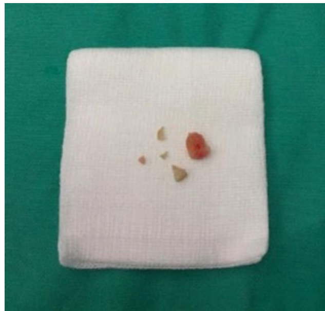
Fig. 2 Pieces of peanuts lodged in right bronchus retrieved.