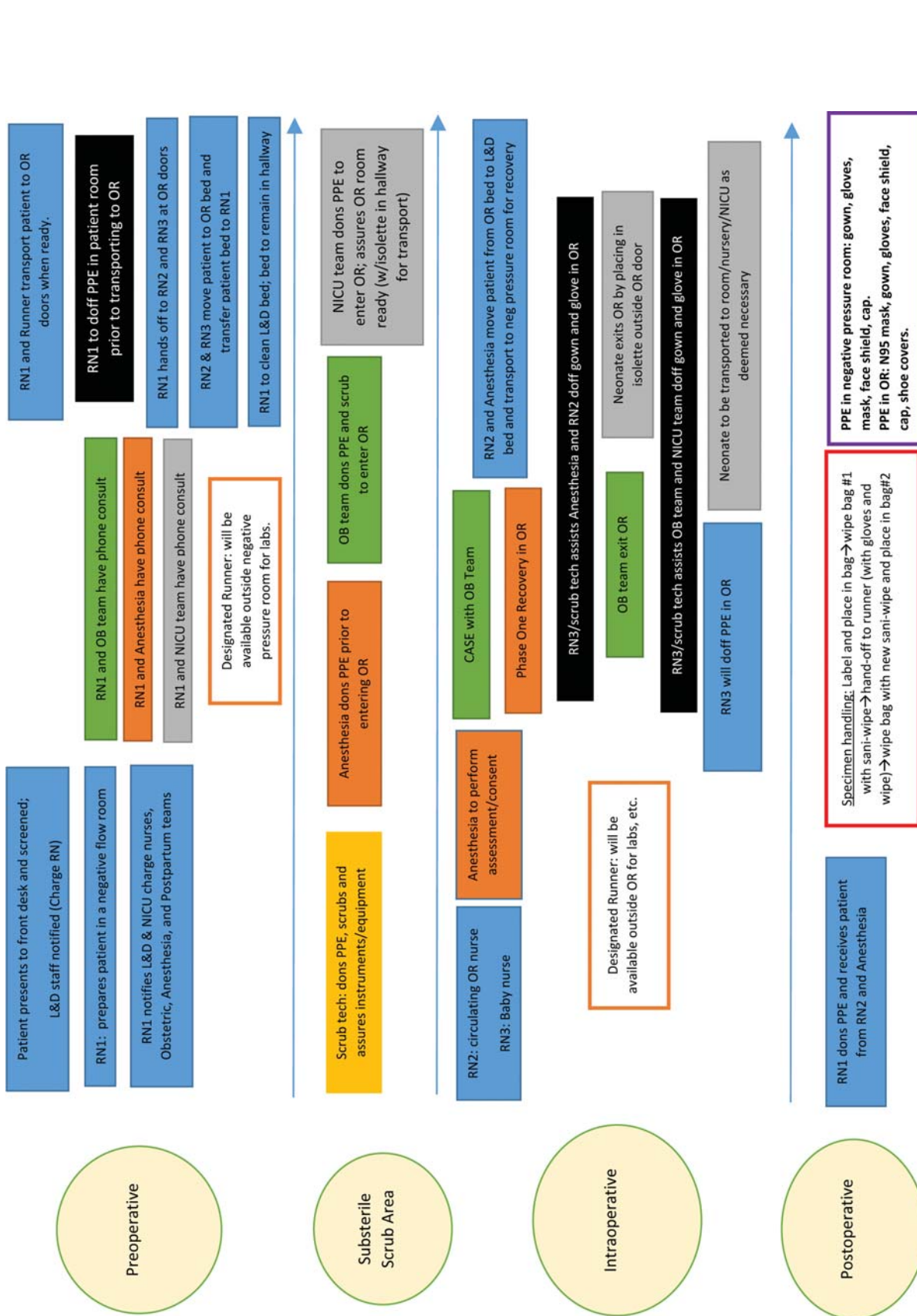
Fig. 1 Algorithm for suspected or confirmed COVID-19 patient necessitating cesarean. COVID-19, novel coronavirus disease 2019; L&D, labor and delivery; NICU, neonatal intensive care unit; OB, obstetrician team; OR, operating room; PPE, personal protective equipment; RN, registered nurse. Colored box indicators: blue box, nursing; orange box, anesthesia; green box, OB; gray box, pediatrics. Note: This protocol and other guidance should be adapted to your specific situation. No guideline can encompass every clinical scenario. Use clinical judgment as needed.