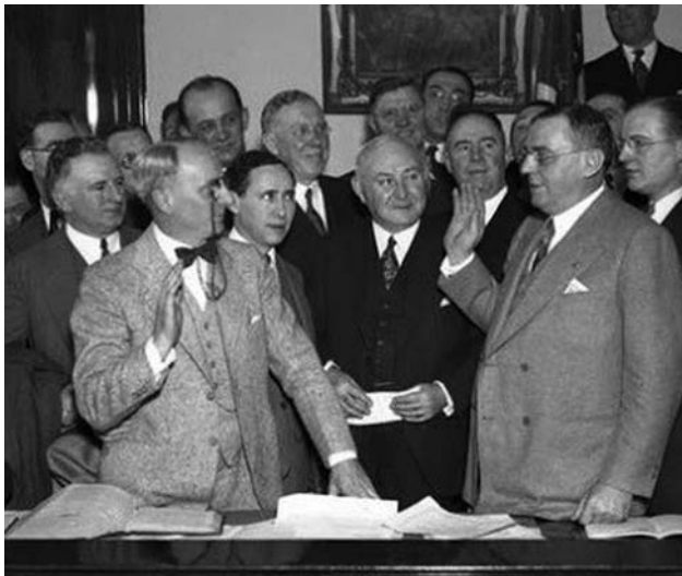
Fig. 2 Cermak sworn into office as the mayor of Chicago (April 7, 1931).

Cermak's recovery was again short-lived because he was back in Florida on January 11, 1932, this time resting