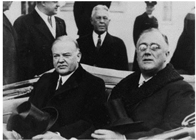
Fig. 5 Franklin Delano Roosevelt and Herbert Hoover riding to Roosevelt's first inaugural address (March 4, 1933).

On February 26, the mayor was diagnosed with an infection in his right lung, which was confirmed by X-ray in the setting of decreased breath sounds on auscultation. According to his physicians, it was unclear if this represented a posttraumatic abscess or pneumonia. 45 Cermak was stable on February 27, his breathing slightly less labored, and he was temporarily removed from his oxygen tent. 46 His downhill course continued on February 28 when his infiltrate on chest X-ray doubled in size. When the mayor's respiratory rate reached 40 breaths per minute and he was gasping for air, he was placed back in the oxygen tent. 47 Despite some encouraging words from his physicians, there was clear evidence that Cermak deteriorated on March 1 and 2. He was moved from the oxygen tent to an oxygen room to guarantee his high-flow oxygen. 48 The colitis was still present, his respiratory rate continued at 30 breaths per minute, and hiccups started on March 2. 49