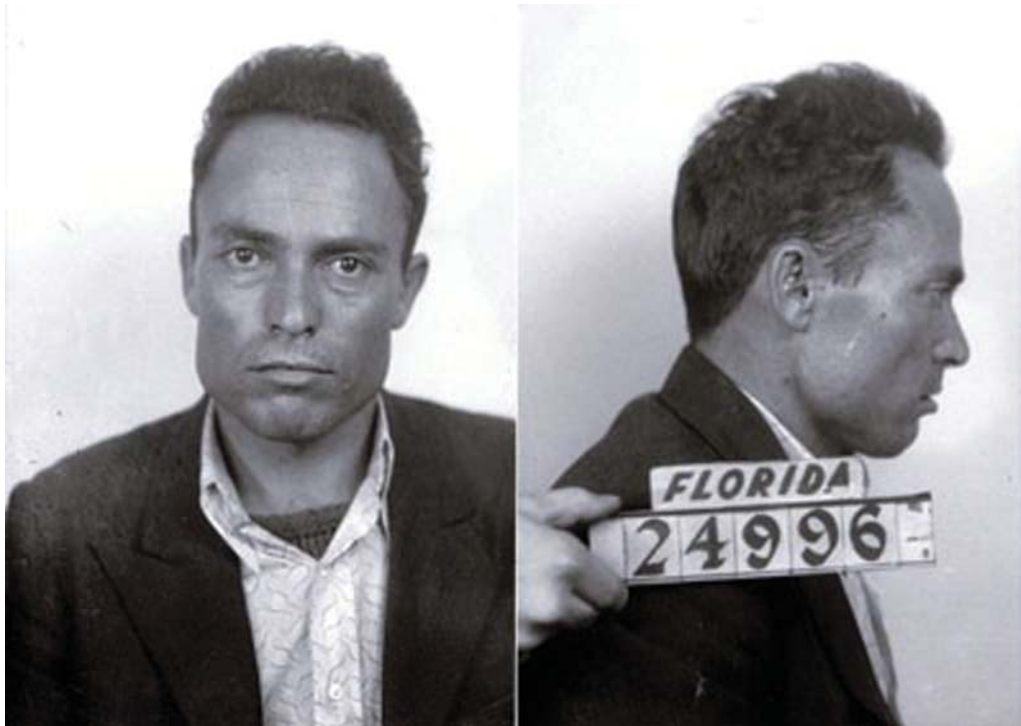
Fig. 4 Giuseppe Zangara

the top of the back seat of his convertible to give his 1-minute speech around 9:40 p.m. After the speech, Cermak, who was sitting with other dignitaries just steps away from the convertible, moved to the running board to shake hands and speak with the president-elect. After speaking with Roosevelt, as Cermak moved away from the convertible, Giuseppe Zangara fired five shots in an attempt to assassinate Roosevelt. 24