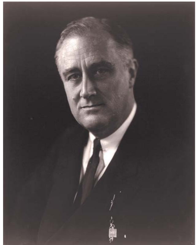
Fig. 3 Franklin Delano Roosevelt, Presidential portrait (1933).

Roosevelt arrived at the park after 9 pm and his car stopped in front of the large crowd that had been waiting for the president-elect to deliver his speech. Roosevelt sat on