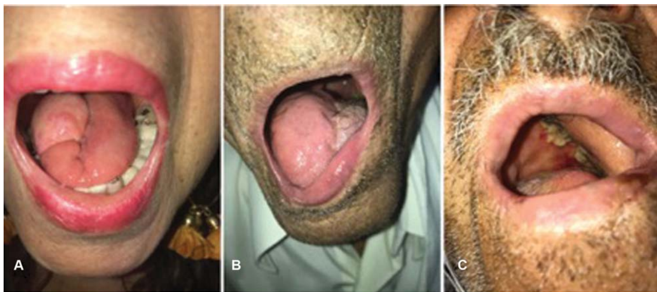
Fig. 2 Post-operative results after submental artery island flap reconstruction of the oral tongue. (A) right hemiglossectomy. (B) left partial glossectomy. (C) soft palate.