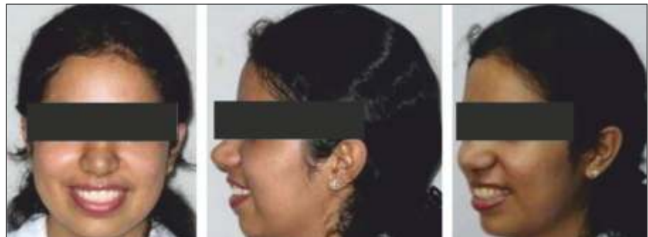
Figure 2 : Still pictures of patient in the order: Frontal Photograph, Profile Photograph and Oblique Photograph