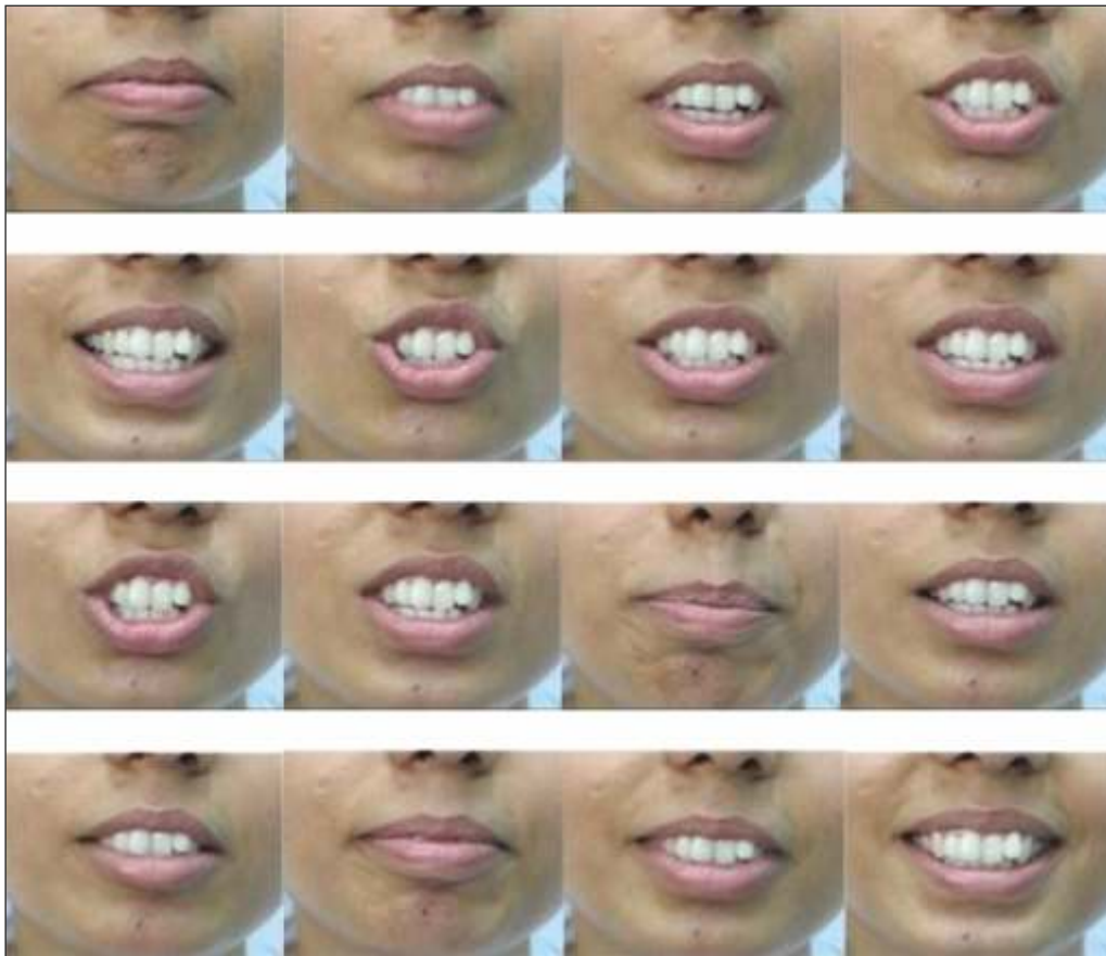
Figure 1 : Dynamic frames from patient's video clip