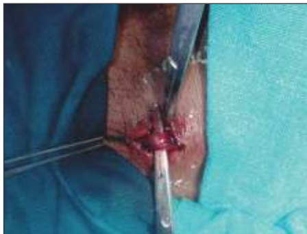
Figure 2 : Vein Identified

Turner el al had reported the first case of an intravascular