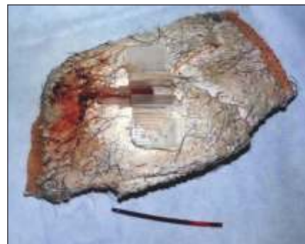
Figure 5 : Fractured IV cannula

embolization of catheter fragments in 1954 as a complication of central venous catheterization. There are two reports regarding embolism of fractured peripheral IV cannula in the literature. Cannula fracture is uncommon and usually occurs during insertion and removal.