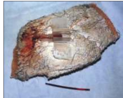
Figure 5 : Fractured IV cannula

embolization of catheter fragments in 1954 as a complication of central venous catheterization. There are two reports regarding embolism of fractured peripheral IV cannula in the literature. Cannula fracture is uncommon and usually occurs during insertion and removal.