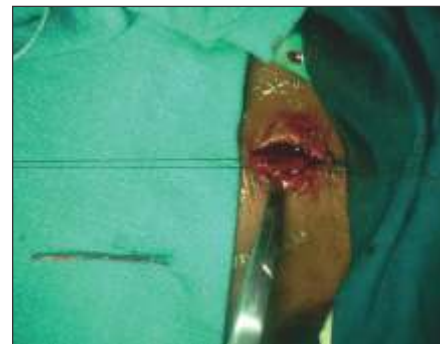
Figure 4 : Cannula Retrived