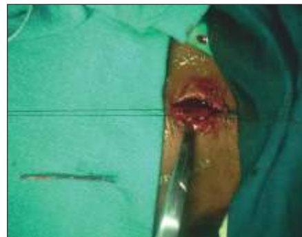
Figure 4 : Cannula Retrived