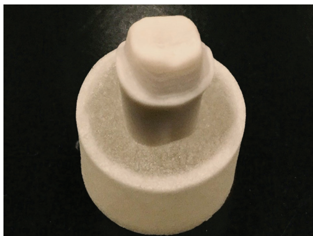
Fig. 1 Prepared ivory tooth (master die).

The duplicated resin dies were painted with two layers of die spacer (Yeti; Yeti GmbH, Germany) on entire axial and occlusal surface except 0.5 to 1 mm of finish line. Silicone Putty Indexes fabricated earlier over the unprepared master tooth were loaded with provisional crown material (Protemp Plus; 3M ESPE, Germany) using auto mixing gun and seated over the duplicated resin dies. Manufacturer's instructions were followed and after the complete setting the provisional crowns were removed from their respective dies (►Fig. 3). The intaglio surface of crown margin marked with a lead pencil and the provisional crowns were finished with acrylic