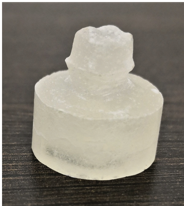
Fig. 2 Duplicated resin die of the master die.