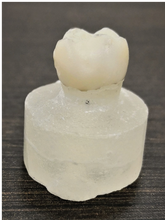
Fig. 3 Sample of fabricated provisional crown over the duplicated resin die.

burs (H79E040; All-purpose E-Cutter system, Dental Instrumentation, Brasseler, United States) using a low speed straight hand piece (KaVo Dental; GmbH, Biberach, Germany). Provisional crowns found with defects visually were discarded