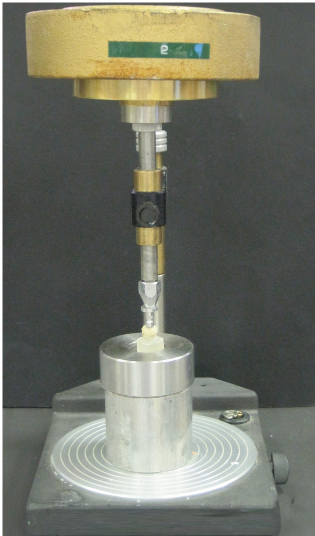
Fig. 4 Customized dental surveyor for standardized loading.

For groups-A and -C, the materials were dispensed in the intaglio surface of the crowns with the help of auto mixing/dispensing guns as per manufacturers' instructions. For the group-B samples, the bottle was shaken and material was sprayed onto the intaglio surface of crowns for 2 seconds to create a uniform layer of the disclosing material as per manufacturer's instructions. For the samples in group-D and -E, the materials were hand-mixed in equal proportions until uniform color was obtained, followed by loading the crowns with the help of a plastic instrument. After application of the disclosing materials, all the specimen crowns were placed onto their respective dies under a standardized vertical load of 5kg (50 N). The load was applied on the occlusal surface with the help of a customized dental Surveyor (►Fig. 4) until each material setting time was completed, followed by the excess flash trimming with sharp blade. 13