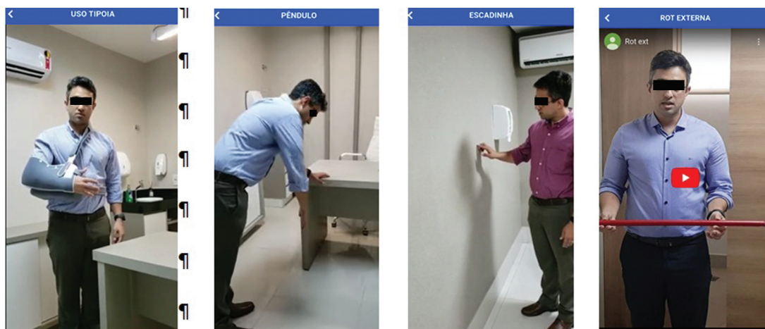
Fig. 1 Guidelines for exercises performance.

The iGenApps software allows the insertion of texts and video links. As such, a series of videos was recorded on YouTube, and links, along with texts, were made available in the app.