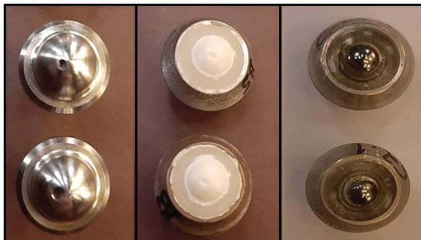
Fig. 3 Deformation in the indenters used in the application of cyclic loading; stainless steel (left), and steatite ceramic (middle) showed clear deformation compared with the tungsten carbide indenters (right).

that the stainless steel and ceramic indenters produced very close results. This may be explained by the relatively close modulus of elasticity of the two materials compared with that of tungsten carbide indenters. Therefore, using indenters that have high-elastic modulus values compared with that of natural dentition like tungsten carbide may lead to over expectation of the performance of zirconia in the clinical service.