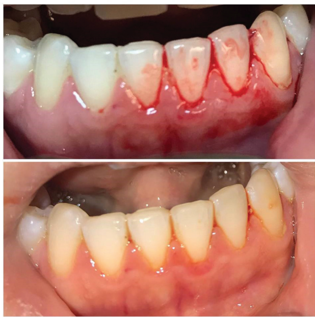
Fig. 2 Subject from Group A: pre- and posttreatment.

or gum dyschromia was not detected. But, as many studies demonstrated, one of the complications of this powerful anti-septic is exactly the coloration of dental surfaces, generally detected after a long period of treatment. 31 That is why it has to be reiterated how tea tree oil, despite a minor efficacy, can still reduce or control the bacterial load without causing nor dyschromia or taste alteration; in fact, all the patients undergoing the treatment with the essential oil complained about nothing in any study. Everything should be considered without leaving out the eventual conditioning of a poor or wrong domestic oral hygiene realized by the patient. At the end of the revaluation session, no toxicity manifestation due to the consumption was shown; the two pregnant patients are an example of this affirmation, given that they did not report any disturb. As reported by the study realized by Hammer et al, 37 it was discovered that the topical use of the product is safe and that complications are random. The data published in this study refer to the presence of toxicity if the product is ingested in massive doses (1.9 per kg of weight).