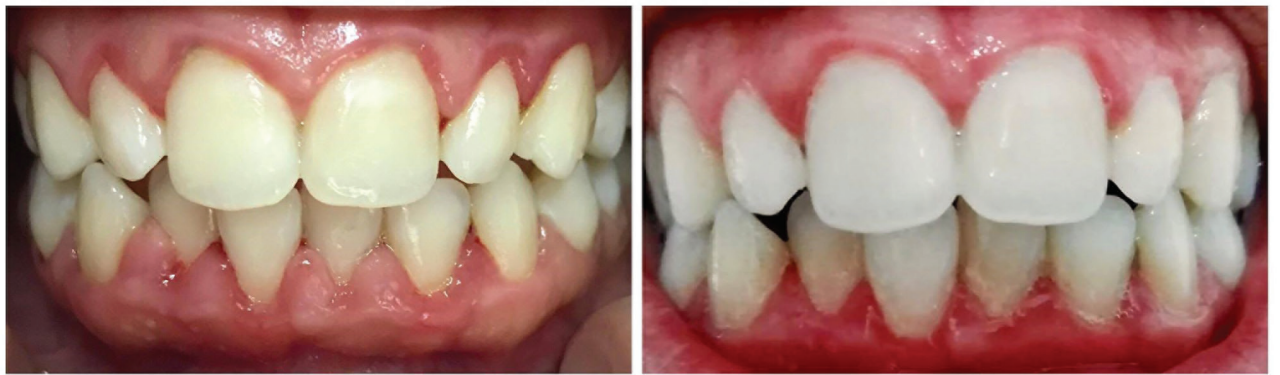
Fig. 3 Subject from Group B: pre- and posttreatment.

Furthermore, in this study, the product was not ingested, but administered through rinses of drops diluted in water, so