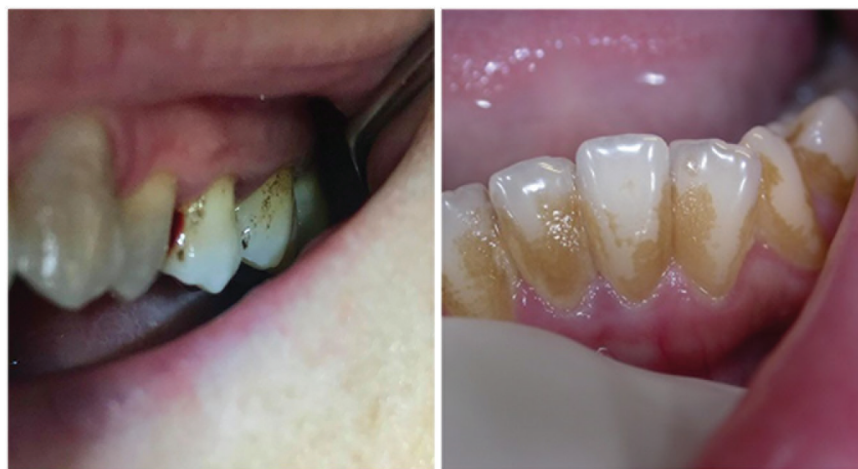
Fig. 4 Posttreatment dental dyschromia in subjects from Group B.