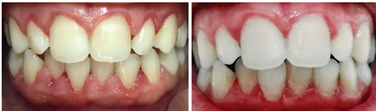
Fig. 3 Subject from Group B: pre- and posttreatment.

Furthermore, in this study, the product was not ingested, but administered through rinses of drops diluted in water, so