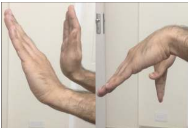
Fig. 2 : Lateral images of the left wrist showing nearly full range of motion of the wrist.