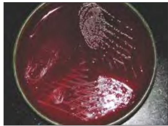
Fig.5 : Colony after 2 months

Institutional Ethical Committee: Approval was granted from Institutional research cell