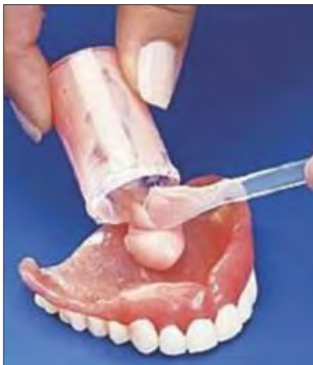
Fig.3 : Denture relining