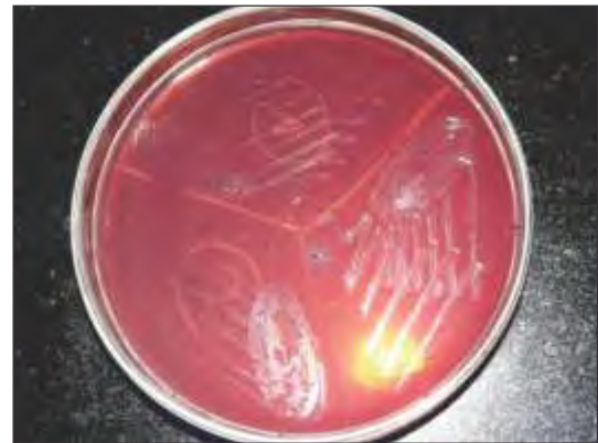
Fig.4 : Sample after 1 month