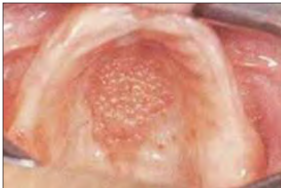
Fig.2 : Mucosal inflammation