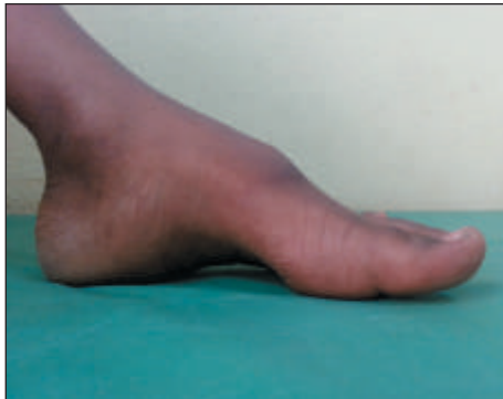
Fig. 1 Pes Cavus

She requires long term follow up for cardiomyopathy and diabetes mellitus.