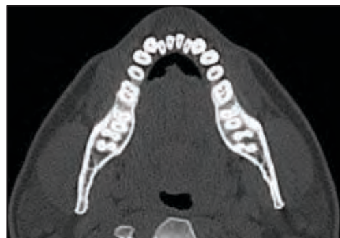
Fig 4 : Axial view of mandibular arch at apical one third of all the teeth