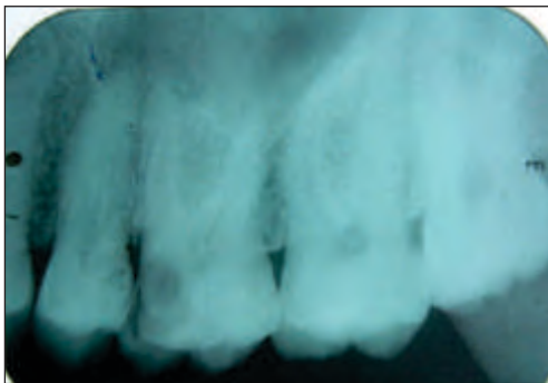
Fig 1: Pre operative radiograph.

One more important finding was multiple extra canals in all the teeth except incisors confirmed by CT scan (Fig 3) . Four canals in right and left maxillary second molar, 4 canals in right maxillary first molar, 2 canals in maxillary