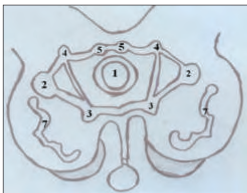
Fig 2 : Showing renal collar in the embryonic period. 1 - Aorta 2 - Inferior cardinal vein 3 - Subcardinal vein. 4 - Supracoelomic vein. 5 - Subcentral vein. 7 - Mesonephros

below the main artery, the former being the more common position. Instead of entering the kidney at the hilus, they usually pierce the upper or lower part of the organ 3 . Studies show that there is more than one renal artery in 15% & 20% of cases on the right and left sides respectively 6 . Abnormalities of renal artery are due to changing position of kidney as a part of its development (Figure 2). The development of kidney begins in pelvic cavity and it then ascends to lumbar region. When they are in pelvic cavity they are supplied by internal iliac artery or common iliac artery. When they reach the lumbar region their arterial supply also shifts from common iliac to abdominal aorta. Thus, the knowledge of development of renal vasculature is essential in order to understand the possibilities of multiple anomalies and variations in renal arteries 4,7,8 .