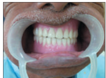
Figure 12 Happy patient