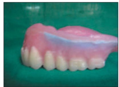
Figure 9 Cured denture