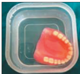
Figure 11 Hollow denture