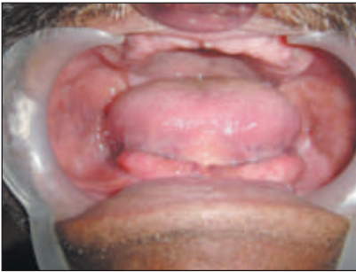
Figure 1 Preoperative photograph