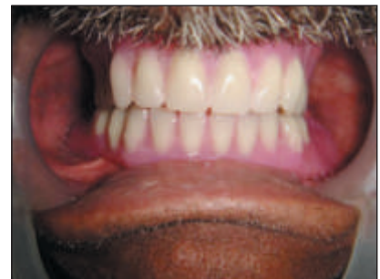
Figure 6 Postoperative photograph