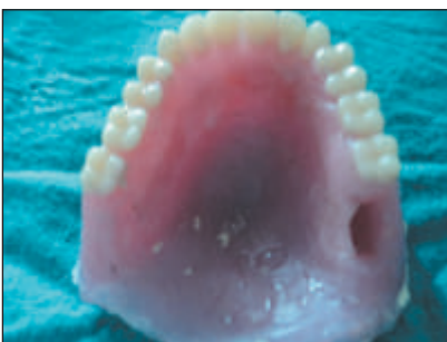
Figure 10 Holes were made in posterior region