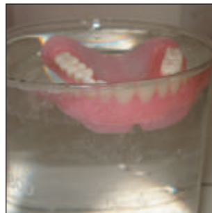
Figure 5 Hollow denture