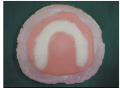
Figure 3 salt placement over heat cure