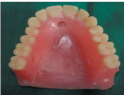
Figure 4 holes were made in polished surface