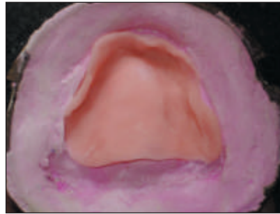
Figure 2 heat cure packing