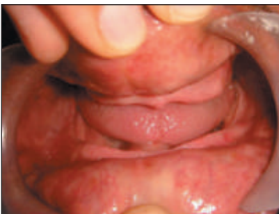
Figure 7 Preoperative view