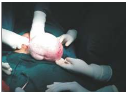
Fig. 2: Ovarian Fibroma seen during surgery