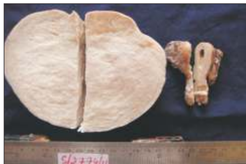
Fig. 4: Cut Section

Fibromas account for 4% of ovarian neoplasms .They present during the fifth and sixth decade.10 to 15% of all fibromas are associated with ascites while only 1% have