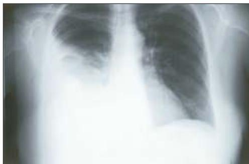
Fig 1: Chest X-ray showing right pleural effusion