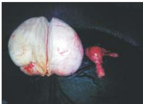
Fig. 3: Ovarian Fibroma specimen