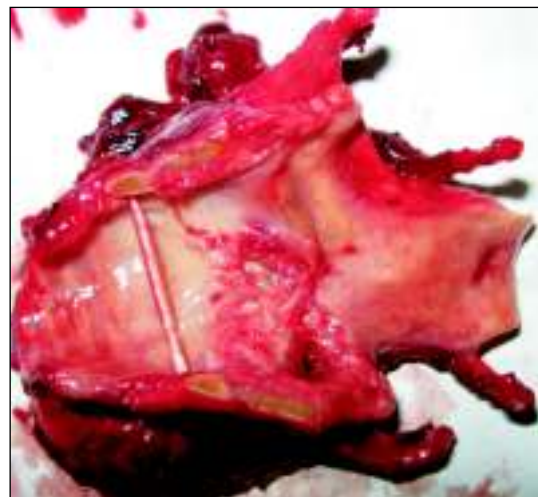
Fig 2: Laryngectomy specimen.