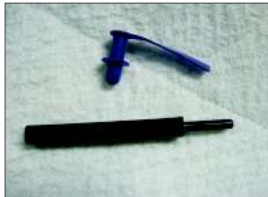
Fig 4: Tracheoesophageal prosthesis. (Nagpur prosthesis)