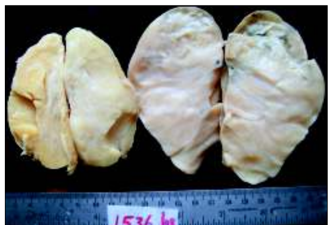
Gross picture showing globular yellowish and grey tan lipomatous masses .

examination showed swelling in the left scrotal region measuring 15x15 cms. The swelling was not reducible on lying down. It was tender and soft in consistency. Routine haematological, biochemical and serological investigations were within normal limits. Scrotal ultrasonography showed bilateral hydrocele with left inguinoscrotal hernia. The clinical diagnosis of bilateral hydrocele with left inguinal hernia was made and treated surgically for hydrocele and hernia. At operation, multiple diffuse lipomatous swellings were seen along the spermatic cord which were excised and sent for