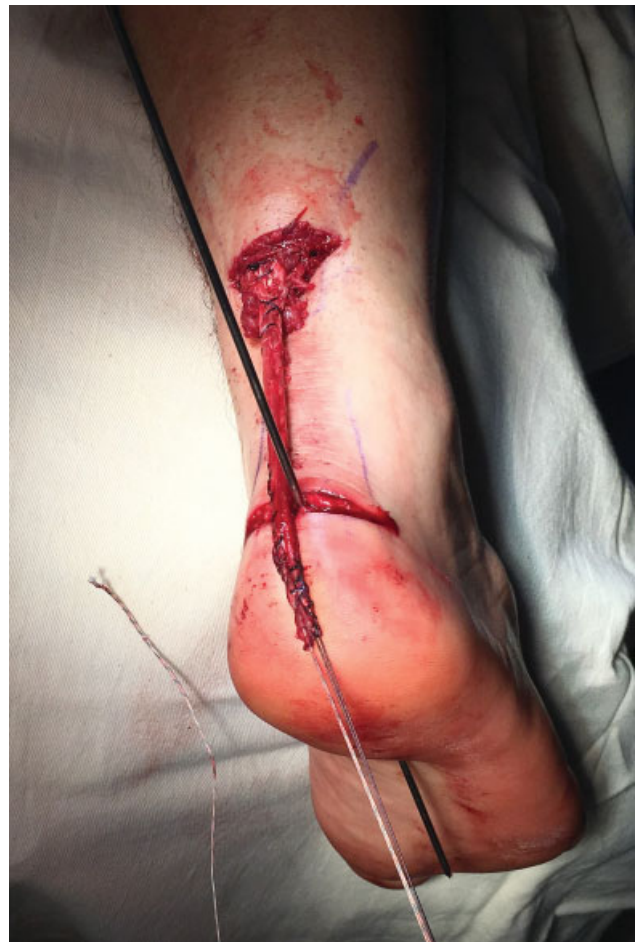
Fig. 3 Reconstruction of a chronic calcaneal tendon injury using an autologous semitendinosus graft in a viable muscle semitendinosus autograft in viable muscle.

Different donor tendons are reported for transfers in chronic calcaneal tendon ruptures. Today, it is understood that this indication is more focused on muscles with fatty degeneration and no functionality for a potential reconstruction. The choice between flexor hallucis longus (FHL),