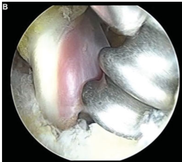
Fig. 4 Endoscopic transfer of the flexor hallucis longus to the posterior calcaneal tuberosity in a patient with chronic Achilles injury and fatty infiltrated triceps.