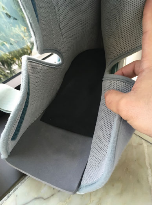
Fig. 1 Functional conservative treatment of an acute calcaneal tendon injury using immediate weight-bearing in a boot with edges to maintain the equinus.

isokinetic evaluation demonstrated that surgery (10–18% difference compared to the contralateral side) provides better rates over 18 months of follow-up. This trend is also seen in other high-quality studies evaluating muscle strength in detail. 22–24 In fact, the vast majority of patients will experience greater plantar flexion strength loss when the treatment is nonsurgical. However, this difference does not compromise their daily living activities, especially in nonathletes and functionally-treated patients. 22–24