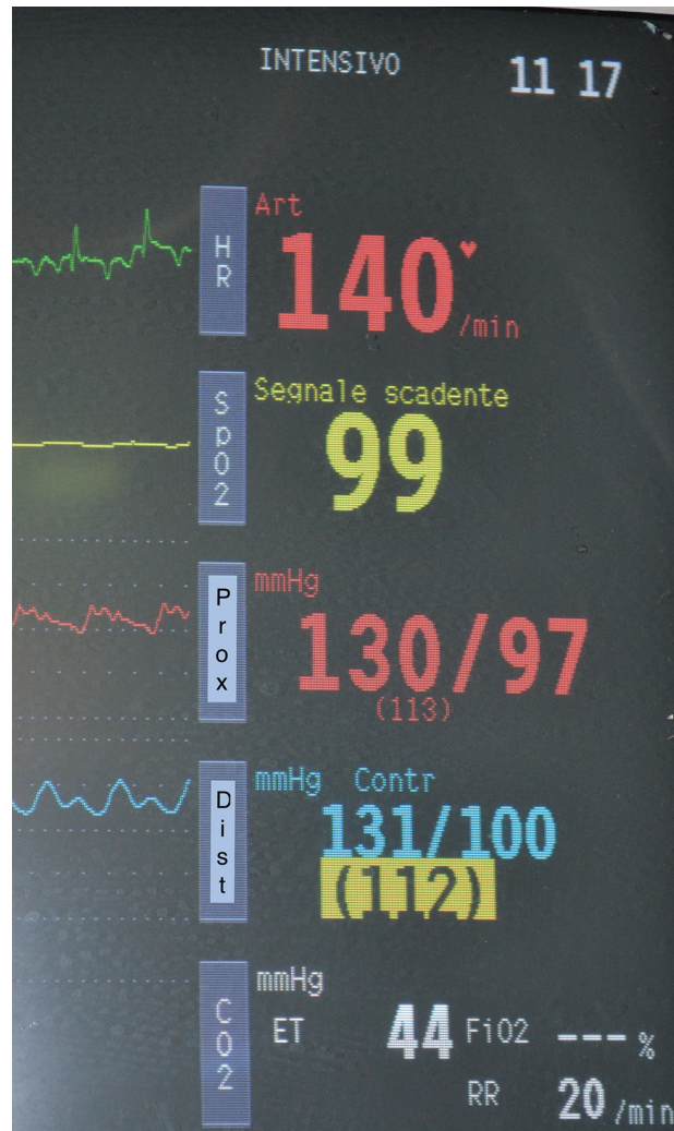
Fig. 3 Invasive blood pressure at the end of the hybrid procedure to show the same arterial pressure in the proximal and distal part of the prosthesis.

Under fluoroscopy, graft deployment was successful, and radio-opaque markers were useful to identify and position the surgical segment at the correct thoracic and abdominal aorta height in all five animals. Once the abdominal aorta was incised and the surgical prosthesis zone was exposed to enable partial crossclamping, no bleeding was noted from the exposed surgical field. At the end of the surgical procedure, no major bleeding or cardiac events occurred.