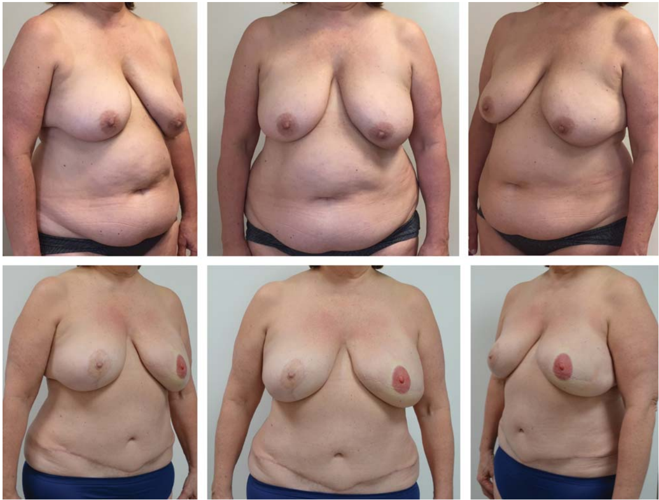
Fig. 3 This patient (BMI = 31.0) presented for immediate breast reconstruction. It was determined preoperatively that she would require a bipedicle-conjoined flap to restore adequate volume to her reconstructed breast, despite her significant pannus and a planned concurrent contralateral mastopexy. Her left mastectomy weight was 937 g. Her bipedicle-conjoined flap weight was 1,484 g initially and 1,026 g after trimming. She is shown postoperatively (below) following a single revision of her abdominal donor site scar and nipple-areola complex creation. BMI, body mass index.

stratification and prophylaxis for thromboembolic events using the Caprini's Risk Assessment score.