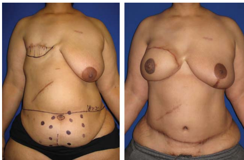
Fig. 1 This patient (BMI = 34.8) presented for delayed breast reconstruction in 2008, 3 years after her mastectomy. At the time of her reconstruction, the senior authors did not perform bipedicle-conjoined DIEP flaps in overweight patients. As such, she underwent unilateral reconstruction with a left DIEP flap (777 g; mastectomy weight unknown). Despite her overhanging pannus, her reconstruction is deficient of both volume and skin when compared with the contralateral side (even after subsequent contralateral reduction). In the authors' current practice, this patient would be reconstructed using bipedicle-conjoined flaps. BMI, body mass index; DIEP, deep inferior epigastric perforator.