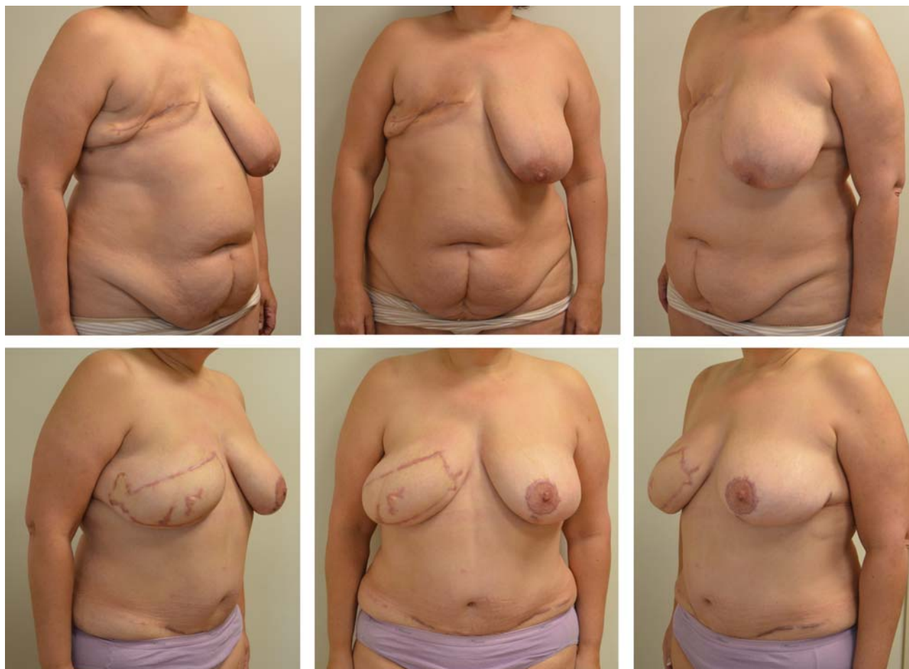
Fig. 4 This patient (BMI = 39.0) presented for delayed breast reconstruction. It was determined preoperatively that she would require a bipedicle-conjoined flap to restore both her skin envelope and an adequate volume to create a symmetric conus, despite her significant pannus and a planned concurrent contralateral mastopexy. Additionally, she had a prior lower midline laparotomy that would decrease the reliability of a single-pedicle three-zone flap. Her mastectomy weight was unknown. Her bipedicle-conjoined flap weight was 1,603 g initially and 1,215 g after trimming. She is shown postoperatively (below) following a single revision consisting of excision of a small area (<2 cm) of fat necrosis, abdominal scar revision with donor site liposuction and nipple creation. BMI, body mass index.

in situations where a single-pedicle flap is deemed insufficient to restore the footprint or conus (► Fig. 2).