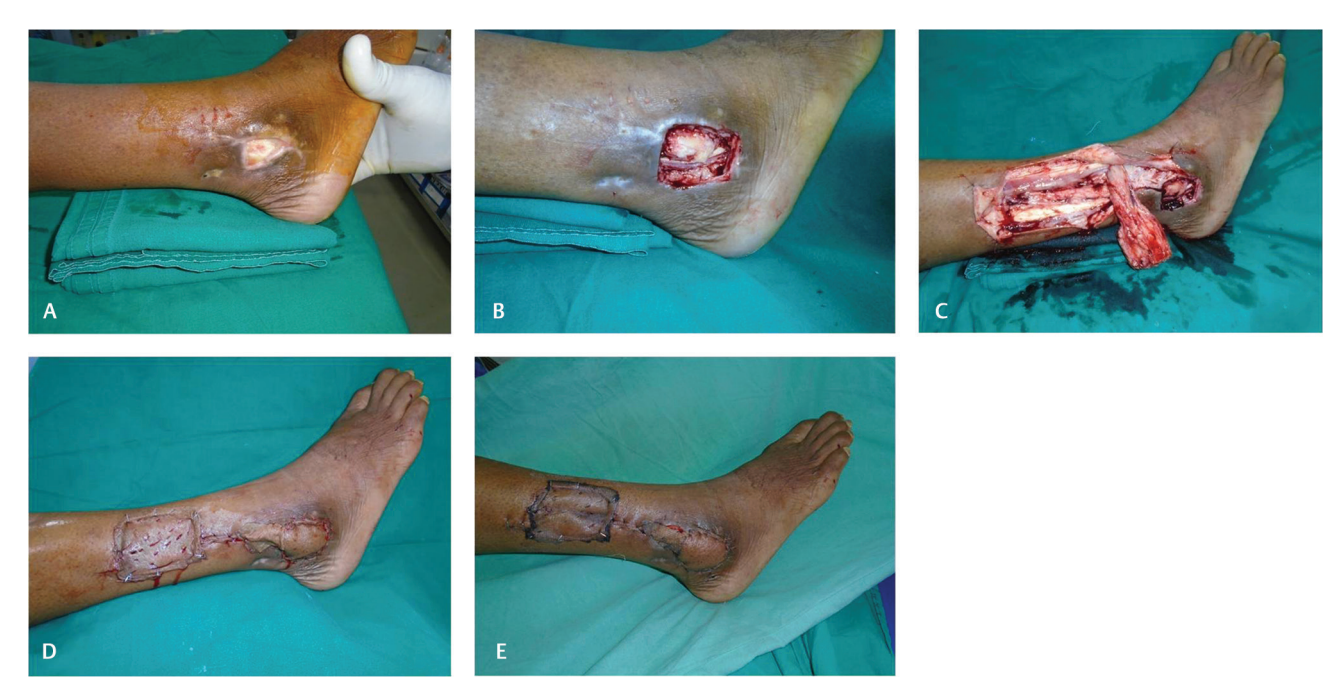
Fig. 2 (A) Diabetic wound infection. (B) Wound after debridement. (C) Flap elevation. (D) Flap inset given and donor site covered with split skin graft. (E) Late postoperative view.