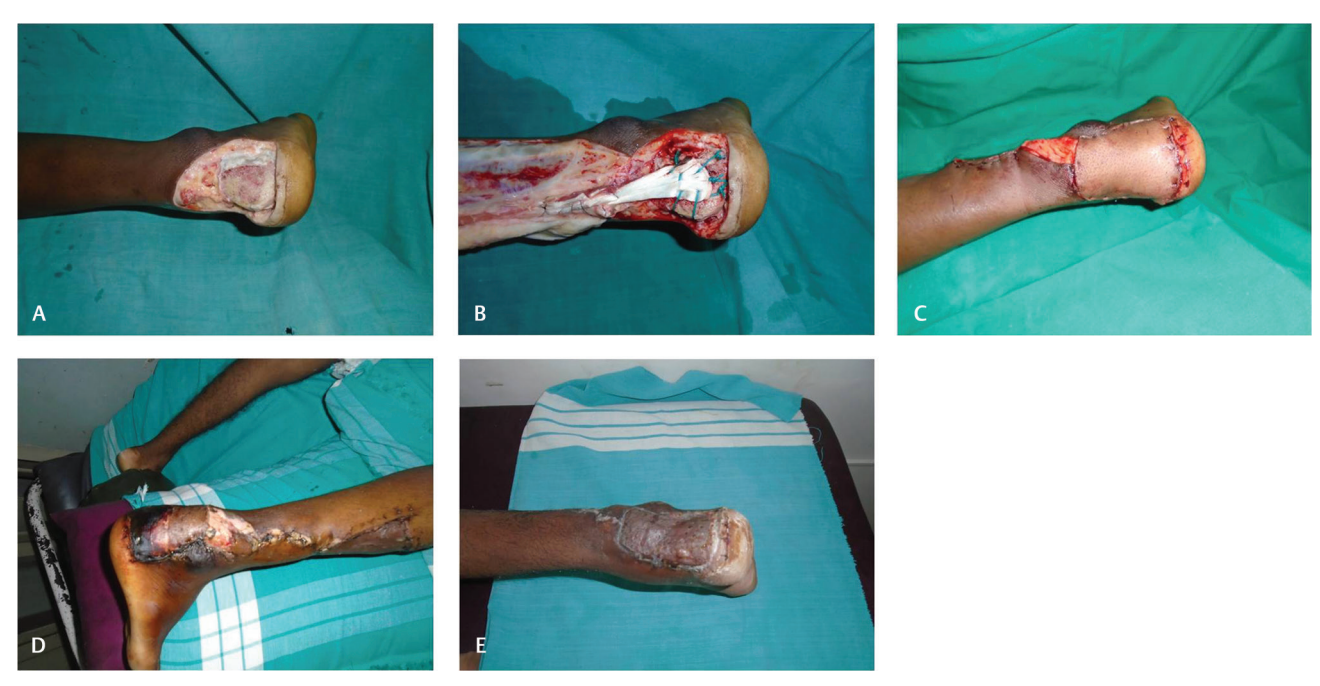
Fig. 5 (A) The defect in the tendocalcaneal region. (B) Reconstruction of the Achilles tendon with proximal mid segment flip over technique. (C) Coverage of the defect with lateral supramalleolar flap. (D) Necrosis of the flap. (E) Skin graft covering of the defect after debridement and allowing granulation tissue to develop.

skin surface area; and (8) they do not sacrifice a major artery of the corresponding length. The advantages of the lateral supramalleolar flap over the reverse sural flap are as follows: (1) The surgery can be performed with the patient in supine position; (2) It is technically less demanding; (3) This flap has a prograde vascular supply when used in proximal defects, while the disadvantages the lateral supramalleolar flap over the reverse sural flap are (1) lesser bulk, (2) limited skin area, (3) increased area of anesthesia over the dorsum of the foot, and (4) increased incidences of venous congestion<sup>6</sup> compared with the reverse sural flap.