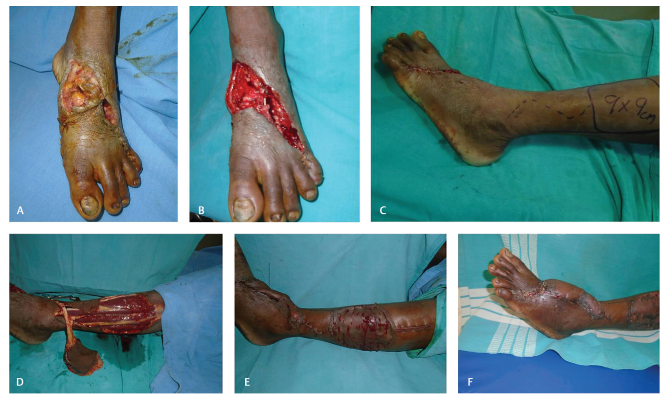
Fig. 3 (A) One-day-old post-traumatic wound over the dorsum of the left foot. (B) Wound debridement done and second metatarsal fracture stabilized with K wire. (C) Wound partly closed and lateral supramalleolar flap of 9 \times 9 cm was marked. (D) Flap elevated. (E) Flap inset to defect and flap donor site covered with skin graft. (F) Late postoperative view.