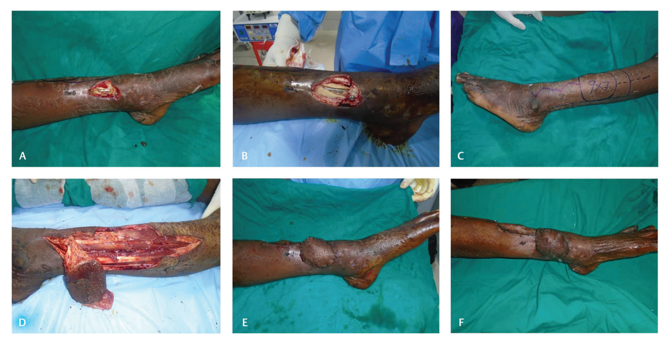
Fig. 4 (A) Soft tissue defect on the medial aspect of the left leg with exposed fracture site and implant. (B) After debridement. (C) Lateral supramalleolar flap of 9 × 7 cm was marked. (D) Flap elevated. (E) Flap inset to defect and donor site covered with skin graft. (F) Late postoperative view.