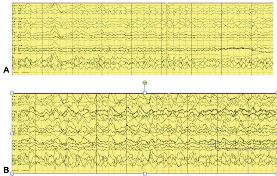
Fig. 2 (A) Fast frequency ictal rhythm was started from the midline electrodes. (B) Bilateral spread of ictal rhythm was noted with high amplitude sharply contoured delta with admixed fast frequency discharges.

attractive, and predominantly irritability and increased salivation were reported as adverse effects. Ketamine by preventing glutamate excitotoxicity may reduce \text{Ca}^{2+} influx and subsequent cell death. Ketamine increases blood pressure, heart rate, and cardiac output, and can counteract negative hemodynamic consequences from other anesthetics commonly used in the management of SE.