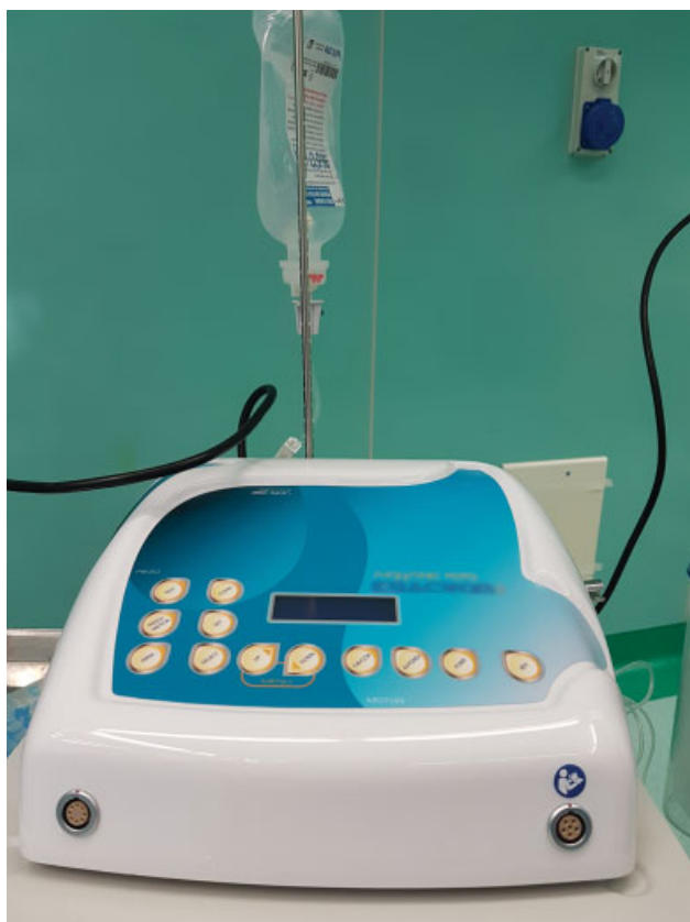
Fig. 1 Main unit, supplying power, and irrigation fluids.

The osteotome equipped was the Surgysonic Moto-II model, (Esacrom, Imola, Italy), a system recently developed for cutting bone with microvibrations. The equipment consisted of a piezoelectric handpiece and a foot switch that are connected to a main unit ( ►Figs. 1 and 2 ), which supplied