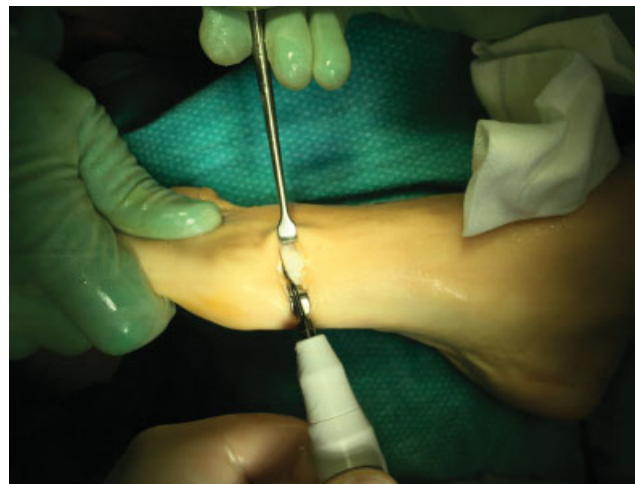
Fig. 5 Cut was made at approximately 15 degrees of inclination in sagittal plane, under visual control, perpendicular to the axis of the second metatarsal bone.

The cut was made at approximately 15 degrees of inclination in sagittal plane, under visual control, perpendicular to the axis of the second metatarsal bone (→ Fig. 5 ). The mediolateral inclination of the osteotomy in transverse