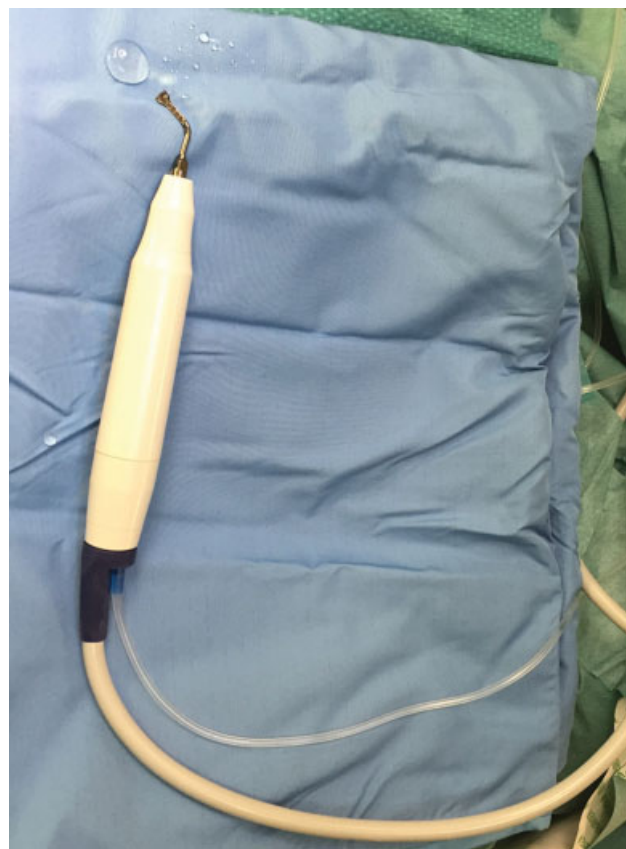
Fig. 2 Sterile piezoelectric handpiece connected to the main unit.

power with sterilizable holders for the handpiece and irrigation fluids. It contained a peristaltic pump for cooling with a jet of saline solution that discharges from the insert with an adjustable flow of 0 to 60 mL/min and removes detritus from the cutting area. This allowed a precise cut and a good visual control of the surgical field. The setting of power and frequency modulation of the device can be selected on a control panel with a digital display. For the handpiece several autoclavable tooltips, called “inserts,” are available ( ►Fig. 3 ).