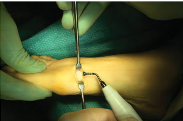
Fig. 4 Medial approach through less than 1-cm skin incision performed at the level of the neck of the 1 st metatarsal bone.

Medial approach through less than 1 cm skin incision was performed, performed at the level of the neck of the first metatarsal (→ Fig. 4 ). The periosteum around the site of the osteotomy was detached first, from 3 to 5 mm just to allow the insertion of piezosteotome. Before proceeding to osteotomy, the site and the direction of the cut could be controlled by intraoperative X-ray. In selected cases, such as first metatarsophalangeal joints free from early-to-moderate osteoarthritic processes, it has been possible to work through a mini-invasive approach without associated articular procedures.