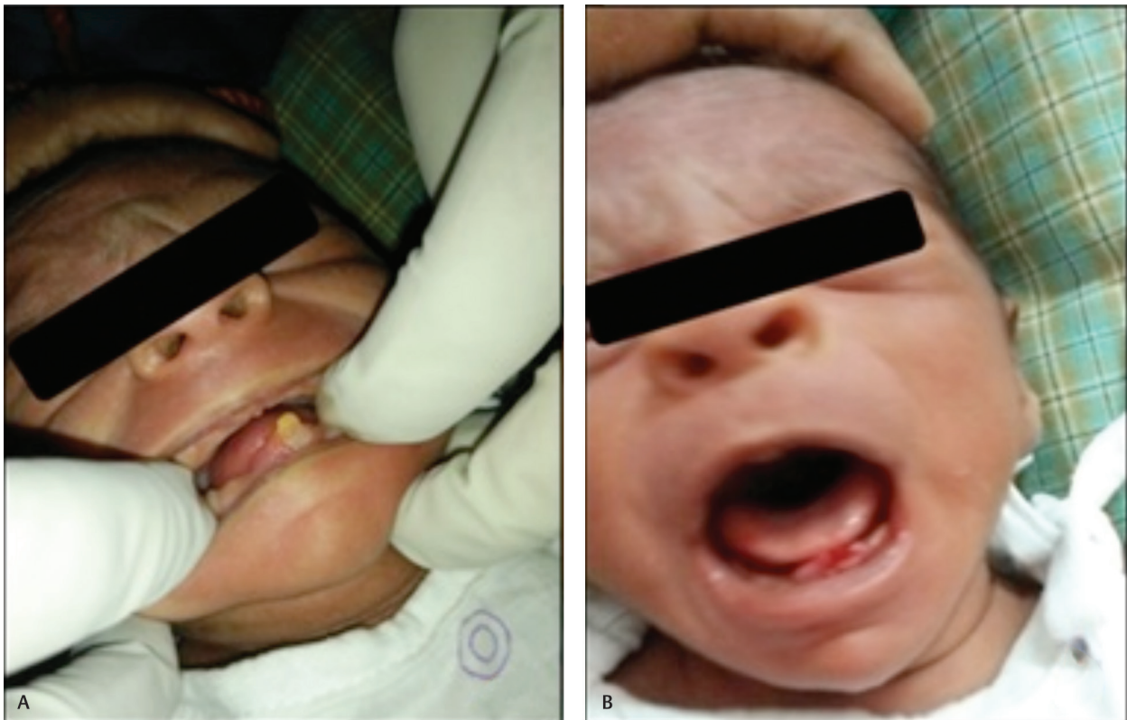
Fig. 1 (A) Yellowish crown appearance of the natal tooth (B) post-extraction.