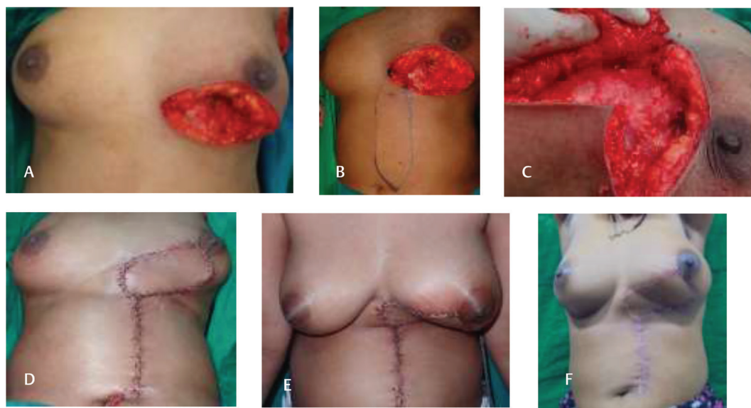
Fig. 2 (A) A 41-year-old female with a defect in the lower inner and lower central quadrant and inadvertent injury to thoracodorsal artery and vein during axillary dissection. (B) Doppler marking of the perforator, with the flap planned around it. (C) Flap raised, showing a superior epigastric artery perforator. (D) After flap inset, the donor site was closed primarily. (E) Immediate postoperative result. (F) Late postoperative result.

medial defects following BCT. 4 The disadvantages are donor-site morbidity and postradiotherapy muscle atrophy resulting in asymmetry. 5-9 A less frequently exercised option using the same donor site is the TDAP flap. The thoracodorsal artery originates from the subscapular axis and courses along the deep surface of the muscle for some distance before dividing into its muscular (transverse and vertical/lateral) branches. These branches pierce the muscle at an angle of approximately 45 degrees to one another and travel through the muscle for a variable distance giving off intramuscular branches before they finally pierce the fascia to supply the subcutaneous fat and overlying skin through a series of perforators. 10 Cadaver dissections