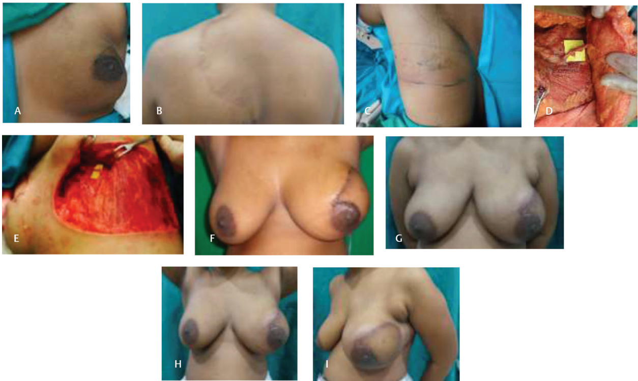
Fig. 3 (A) A 36-year-female with proposed excision in the upper outer quadrant. (B) Scar from a previous spinal surgery; the patient is dependent on a crutch. (C) Doppler marking of the perforator, with the flap planned around it. (D) Flap raised, showing a thoracodorsal perforator. (E) The preserved thoracodorsal nerve and muscle after flap harvest. (F) Immediate postoperative result. (G–I) Late postoperative result.

is amenable for the coverage of the upper outer, central, and lower outer quadrant defects. The reach for defects in the inner quadrant might be less and will depend on the length of available perforator and pedicle. A modified version of this flap, described as the extended TDAP flap, has been described by Angrigiani et al for larger volume breast reconstruction (including whole breast reconstruction) and coverage of implant. 18