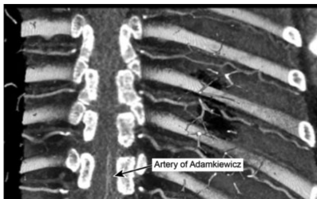
Fig. 2 AAK inlet on the left side at T11 level.

Two observers independently assessed CT scans using the same workstation (Vitrea by Vital Images, Inc.). Observer 1 was a radiologist with 15 years of experience in performing and interpreting diagnostic angiography, whereas observer 2 was a spine surgeon with 20 years of practice. Observer 1 performed