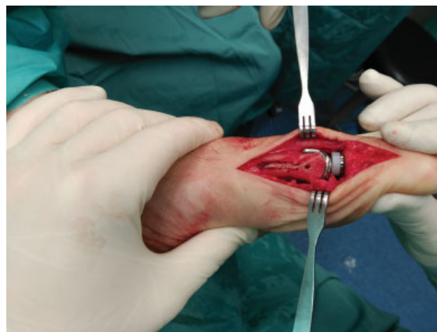
Fig. 1 Intraoperative photograph of 1MTP replacement showing correct fit of the implants.

For 1MTP arthroplasty, the same prosthesis was used (Metis, Newdeal SA Integra Lifesciences ILS, Plainsboro Township, NJ, USA). This is a 3-component, noncemented hydroxapatite coated, nonrestrictive, titanium modular prosthesis. A medial incision was made from the middle of the phalanx to the middle of the metatarsal to expose the first metatarsal-phalangeal joint. To prepare the articular surfaces, the osteophytes and cartilage were removed and a bunionectomy (when necessary) was performed. After determining the size of the metatarsal component, the metatarsus was cut using a metatarsal cutting guide and the implant was tested. Importantly, whenever the patient had index plus, the metatarsal cut was performed to reduce its length to the same length of the second metatarsal (index plus minus). The phalanx was then prepared with reamers and the appropriate sized implant was chosen and tested.