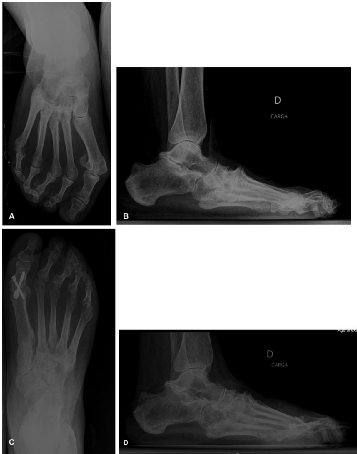
Fig. 4 Pre- and postoperative X-ray images of a 58 year old woman with hallux rigidus submitted to 1MTP arthroplasty. (A) Preoperative standing anteroposterior X-ray; (B) Preoperative standing lateral X-ray; (C) Postoperative standing anteroposterior X-ray 3 years after surgery; (D) Postoperative standing lateral X-ray 3 years after surgery.