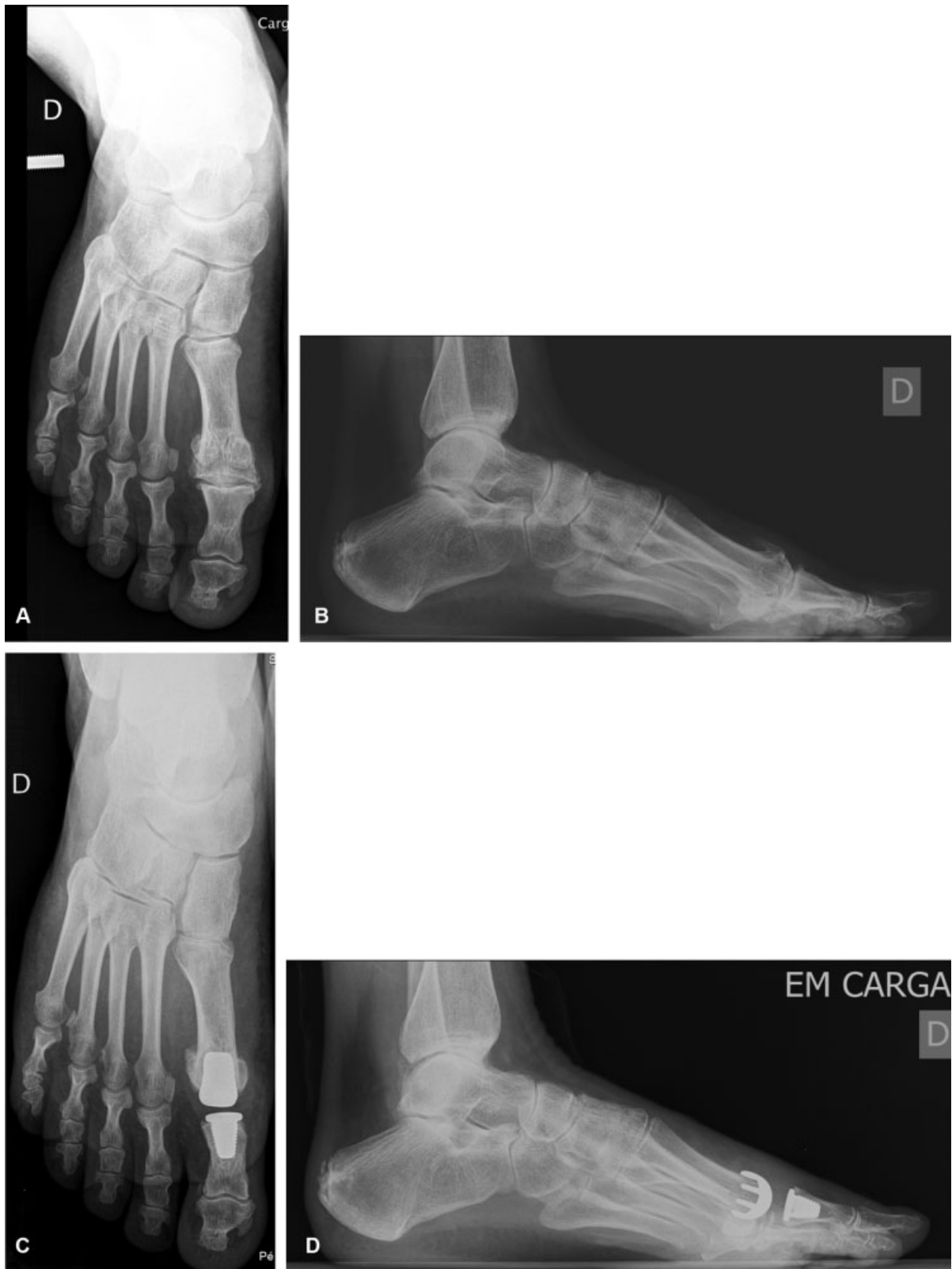
Fig. 3 Pre- and postoperative X-ray images of a 62 year old man with hallux rigidus submitted to arthrodesis with crossed-screws. (A) Preoperative standing anteroposterior X-ray; (B) Preoperative standing lateral X-ray; (C) Postoperative standing AP X-ray 2 years after surgery; (D) Postoperative standing lateral X-ray 2 years after surgery.