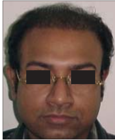
Figure 3: AG-Post-HT of 2000 FUGs