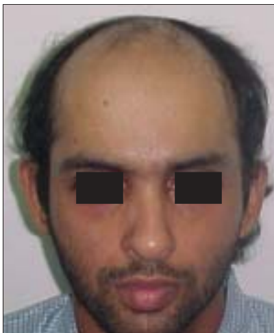
Figure 8: VB- Pre-Hair Transplant (HT)

Usually 250–300 single hair (micro)grafts will be necessary to create a new hairline in any individual. The micrografts in the hairline should be placed in an irregular saw-toothed pattern of macro- and microirregularity [4] to give a natural appearance. Behind the hairline, two-hair FUGs are used to provide new hair. Three or four hair FUGs are used just further behind. The less ideal the hair and skin characteristics, the more important it is to use smaller grafts. To give good density in alopecic recipient areas, some surgeons use punch grafts that are 1, 1.25, and 1.5 mm in diameter, behind the hairline. The punch grafts have the advantage of removing a circular area of bald tissue where the grafts will be placed. These punch