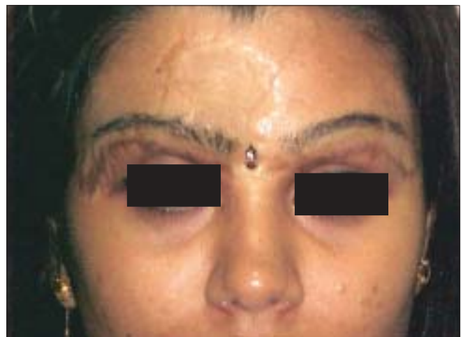
Figure 11: SK- Post-Hair Transplant of Eyebrows