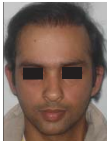
Figure 9: VB-Post-HT of 1900 FUGs