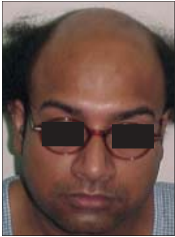
Figure 2: AG- Pre-Hair Transplant (HT)