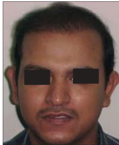
Figure 5: BD-Post-HT of 1800 FUGs