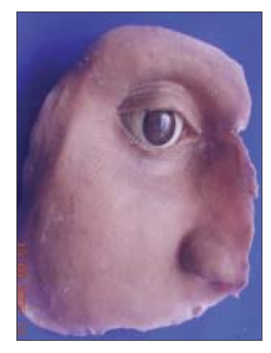
Figure 4: Superficial facial prosthesis with eye shell

When he came to us, there was residual slough and sequestrum showing growth of Candida type fungus isolated on culture media. The patient was treated with systemic antifungal therapy (intravenous fluconozole 6 mg/kg once daily for 2 weeks). CT scan of the face and brain did not show any intracranial involvement by the fungus. Thorough debridement of slough and sequestrum was undertaken [Figure 1] under antifungal cover and the raw areas in the orbit and maxilla were covered with split thickness skin graft. After complete healing of wounds, patient was considered for maxillo-