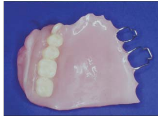
Figure 3: Partial maxillary denture

of right eye at a district hospital by an ENT surgeon. Patient was a known diabetic since the last 12 years taking insulin for control of diabetes mellitus. Following an episode of diabetic ketoacidosis, he developed rapidly spreading naso-orbital mycosis and gangrene necessitating emergency maxillectomy and evisceration of an eye.