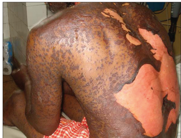
Figure 3: Toxic epidermal necrolysis affecting the trunk and the extremities. The cutaneous lesions on the trunk were confluent with wide epidermal detachments

The skin of the trunk, lower extremities and the oral mucosa were affected in most of the cases that were seen in the study. The anal mucosa was the least affected. This may be due to the fact that the anal region is often not examined, especially in the absence of symptomatology that are related to the area. Diagnoses of respiratory tract mucosal involvements were only made on clinical grounds, when signs of respiratory problems are present. The arterial oxygen saturation levels were closely monitored in all patients with respiratory tract involvement. Supplementary oxygen was supplied with intranasal catheters whenever the saturation levels dropped to 95%. Chest physiotherapy was also commenced and continued until the patients were discharged. The patients were also adequately motivated. There was no need to use