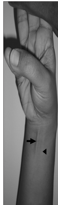
Figure 2: Modified Schaeffer's test - opposed thumb against little finger with flexion at wrist and extending pressure applied to middle three fingers. Arrow – Palmaris longus tendon, Arrow head – Flexor carpi radialis tendon