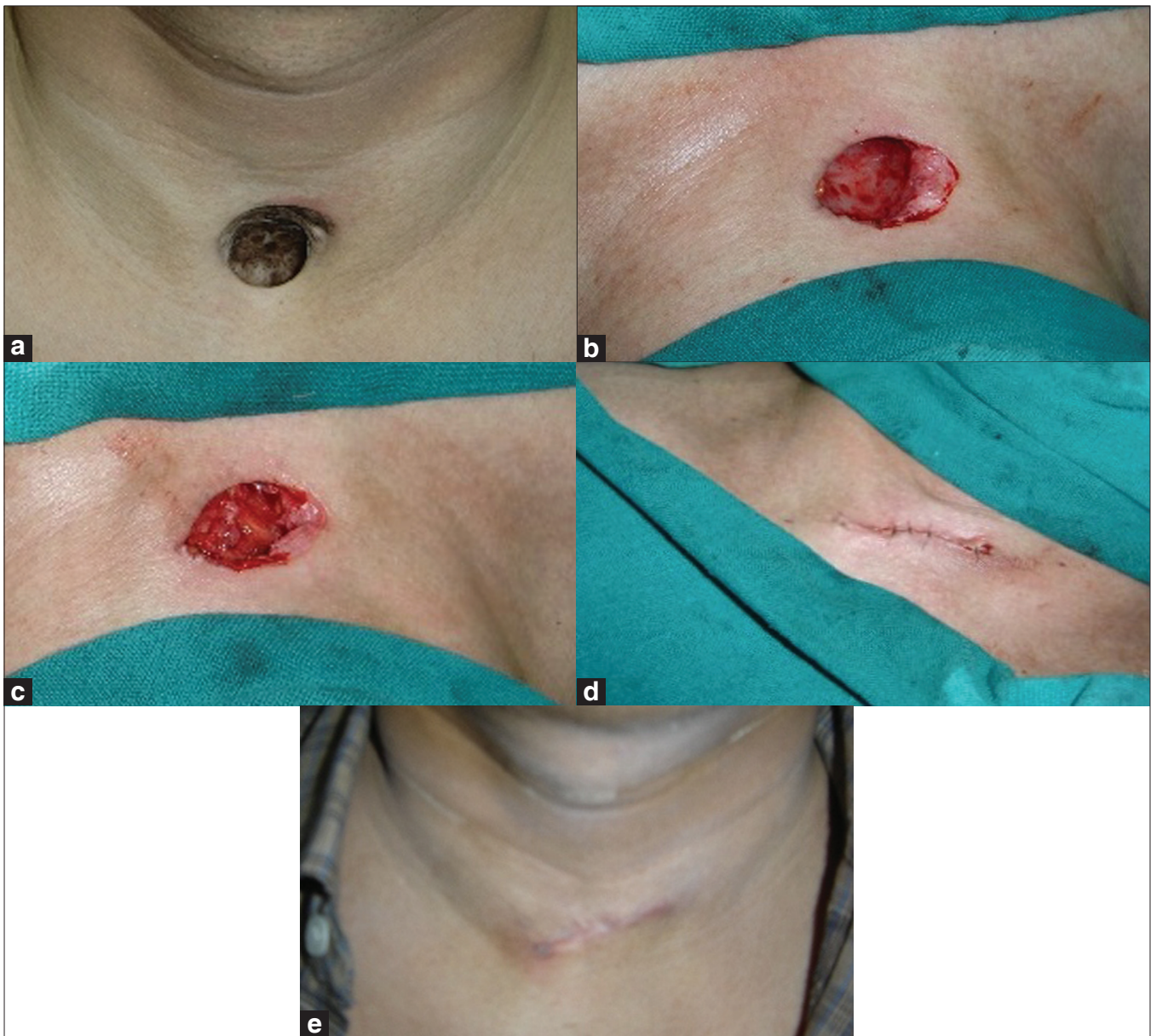
Figure 1: (a) Preoperative showing depressed scar at suprasternal notch area; (b) defect after excision of scar; (c) platysma muscle flap advanced into the defect; (d) closure of wound transversely; (e) final result

the suprasternal notch. He had an abscess in this area about 5 months back. A scar was formed after abscess drainage and healing by secondary intention. The scar was excised. Skin margins were freed. Platysma muscle was freed transversely and advanced into the defect. The wound closure was done horizontally [Figure 1 a–e].