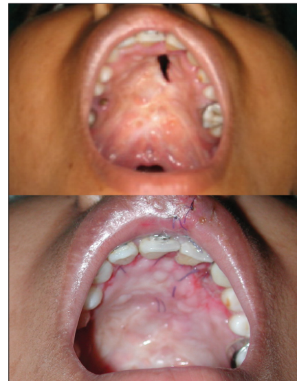
Figure 1b: Fistula repair by alveolar extended palatoplasty