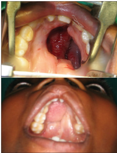
Figure 2: Tongue flap for fistulae repair

Although palatal fistula is a common morbidity after cleft